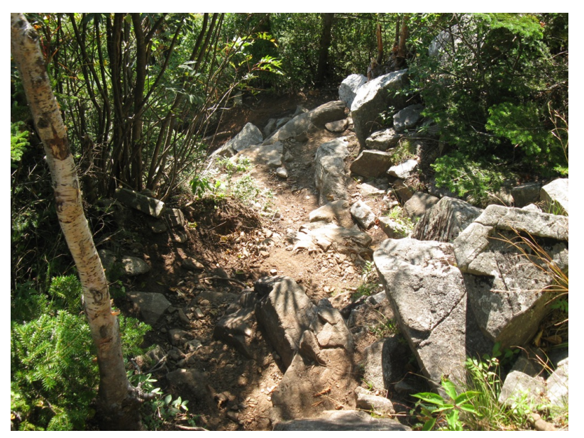
The steep trail down to the South Branch Carrabasset River