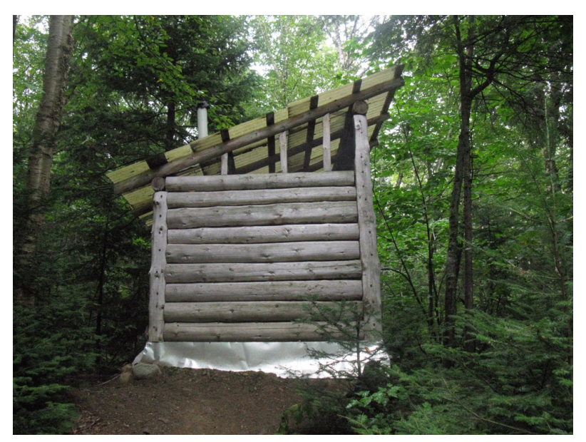
The privy at Piazza Rock Lean-to