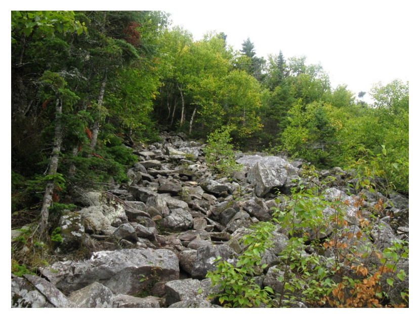
The trail up South Crocker Mountain