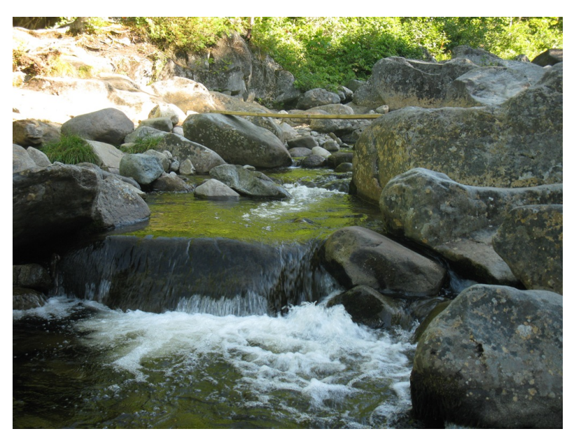
Board bridge over the South Branch Carrabasset River