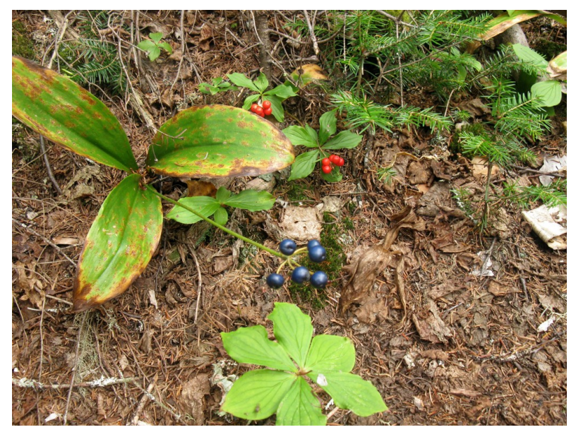
Two kinds of berry