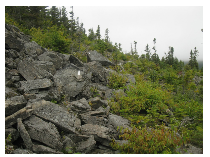
The trail up South Crocker Mountain