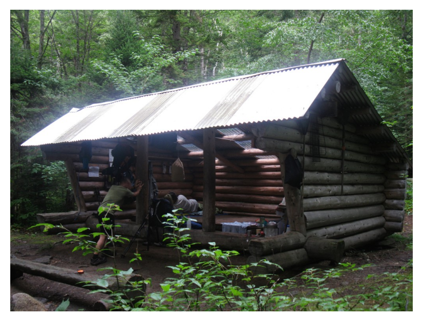
Piazza Rock Lean-to