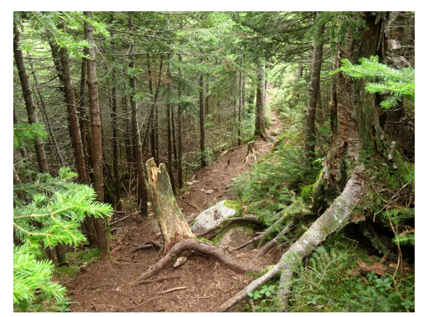
The trail down North Crocker Mountain