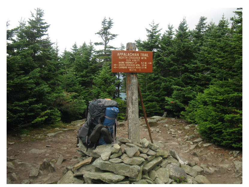
The summit of North Crocker Mountain