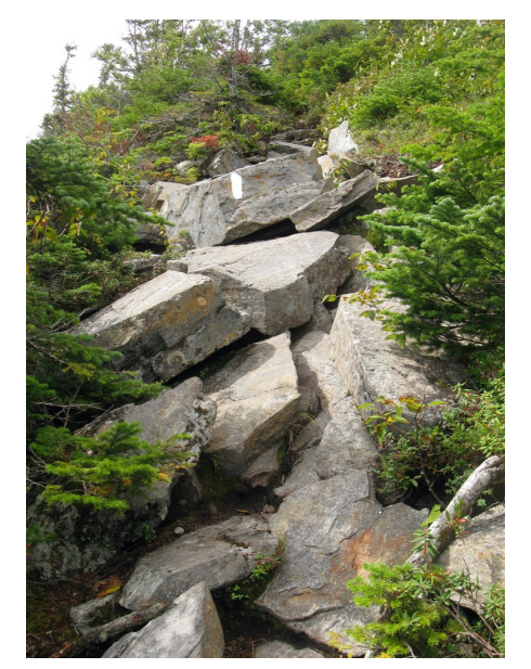
Looking back up the trail down The Horn