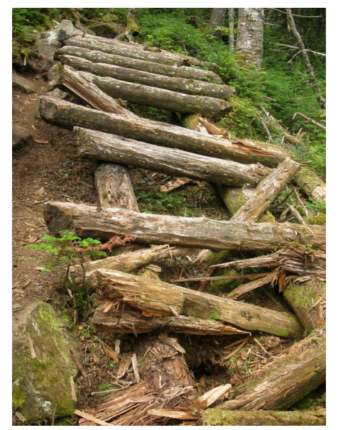
Rotted log steps