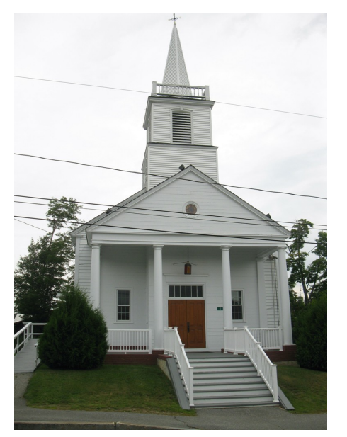
Rangeley Baptist Church