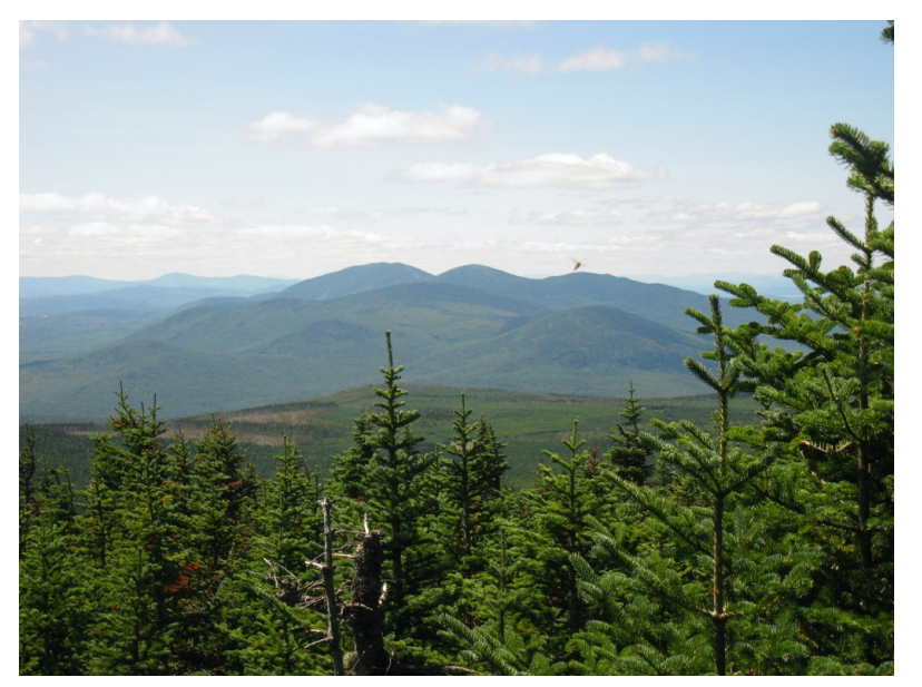
The view south from Spaulding Mountain