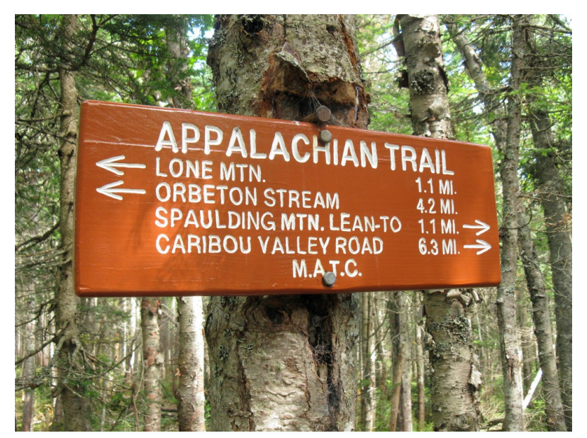
Trail sign on Lone Mountain