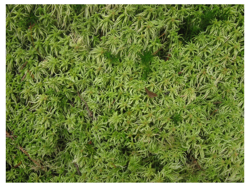
Mossy ground cover