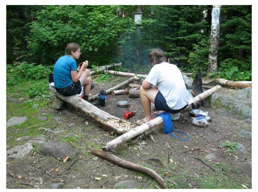
"Cheese" and "Abel Night Road" at Crocker Cirque