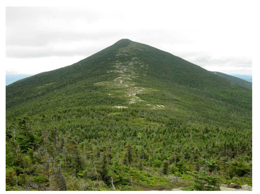
Looking back at Saddleback Mountain