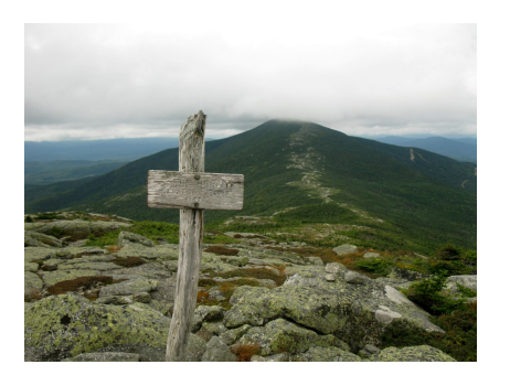
August 22 - 25, 2010