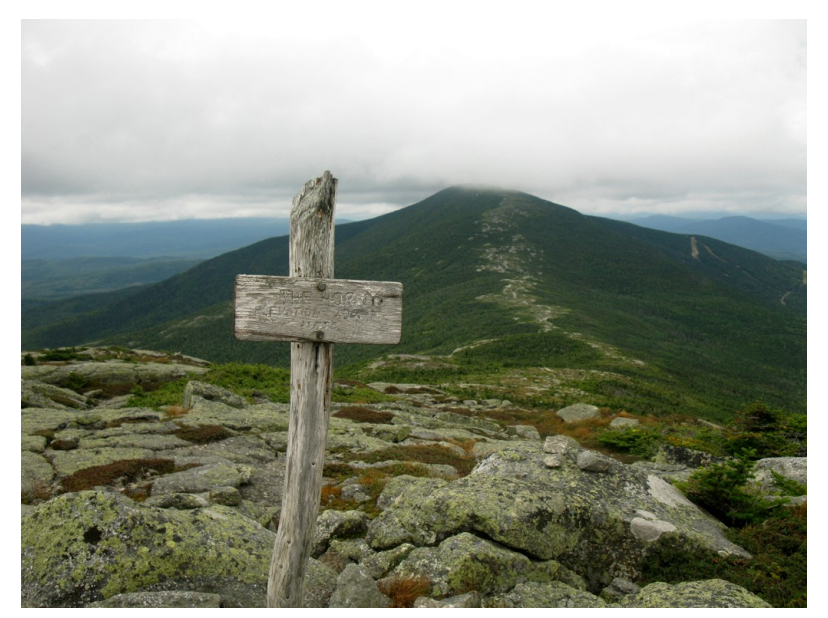
Looking back at Saddleback Mountain