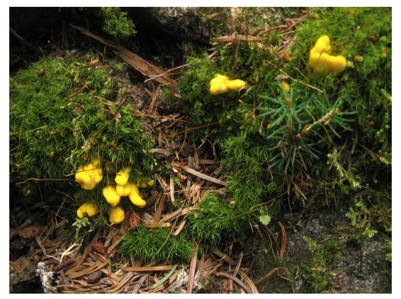
Fungus and moss