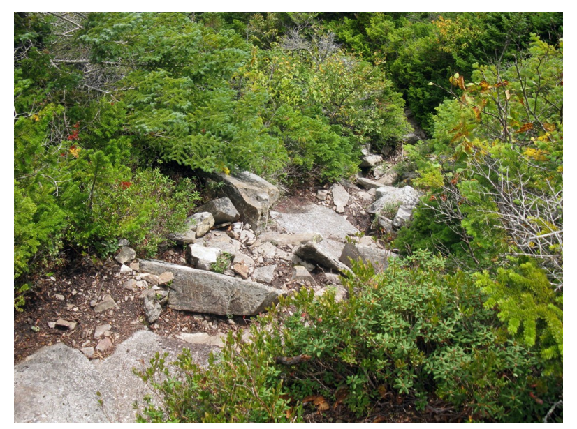
The trail down The Horn