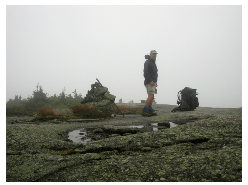
On the summit of Saddleback Mountain