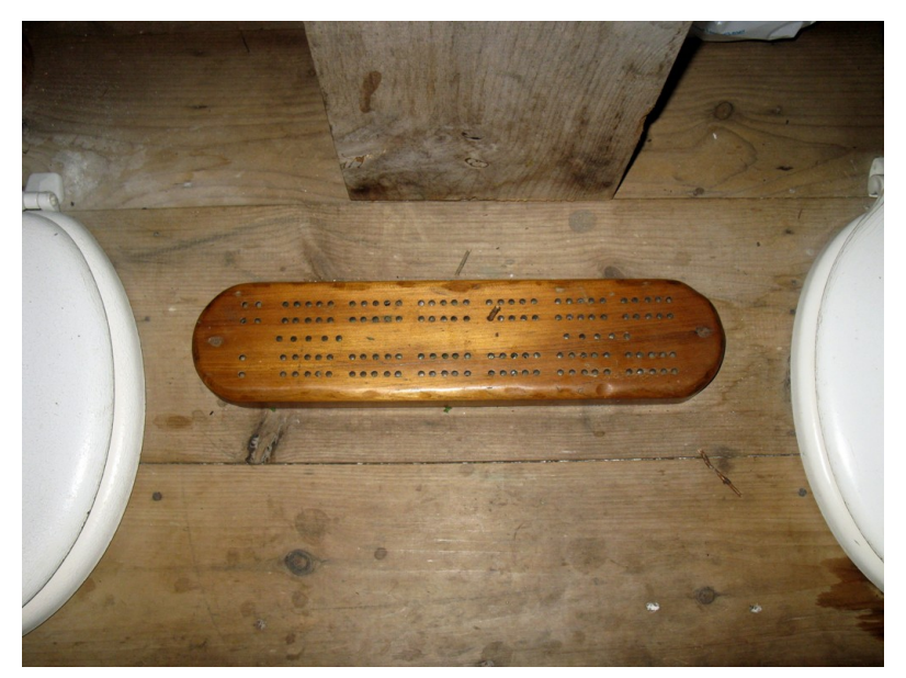
The cribbage board in the privy