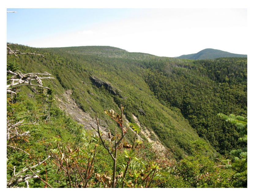
The west side of Sugarloaf Mountain