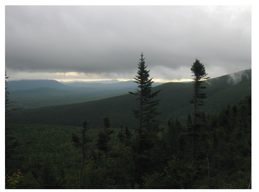
The view east from South Crocker Mountain