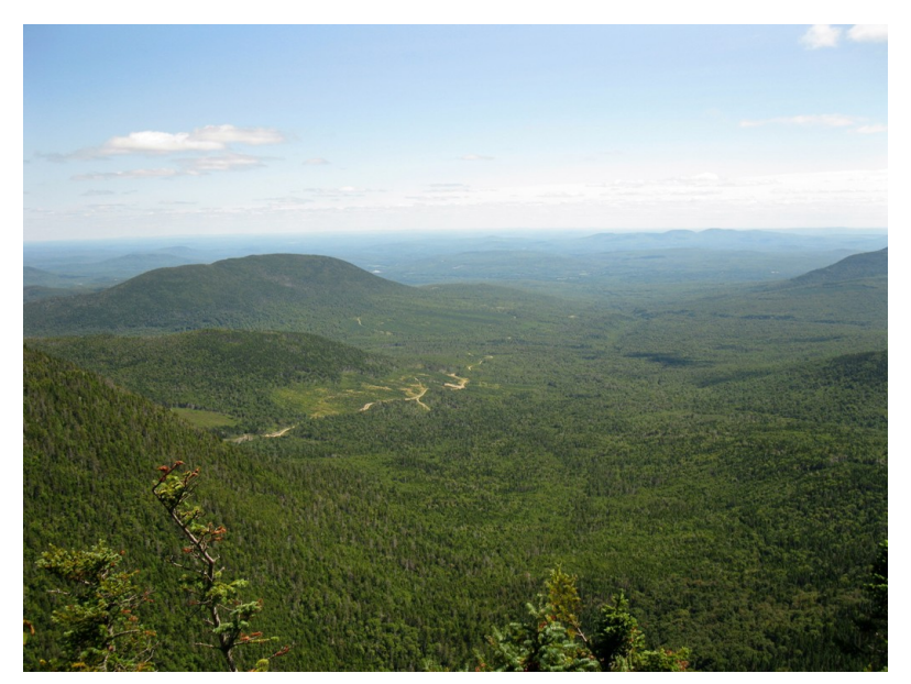
The view southeast from Sugarloaf Mountain