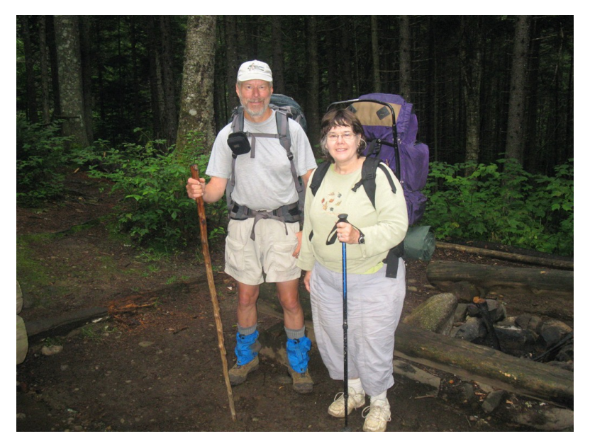
Leaving the shelter in the morning