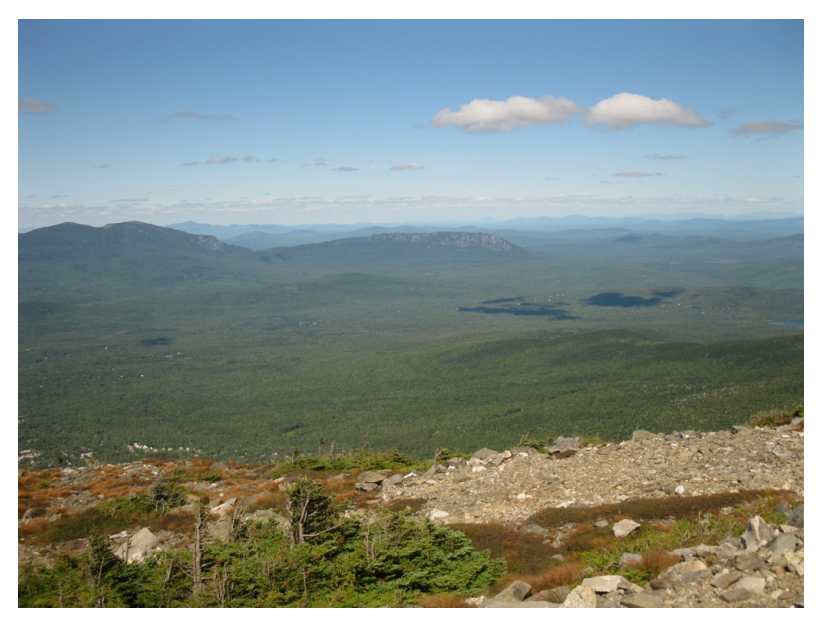
The view north from Sugarloaf Mountain