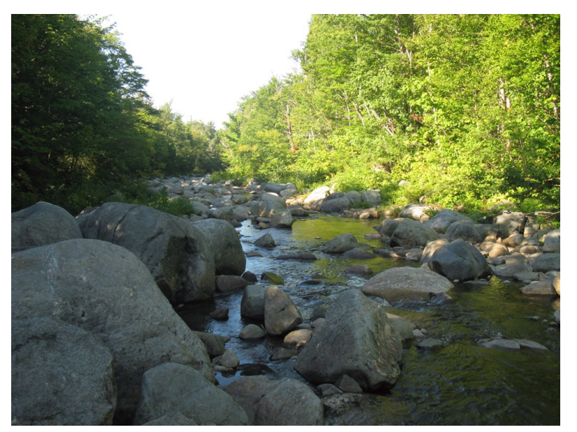
South Branch Carrabasset River