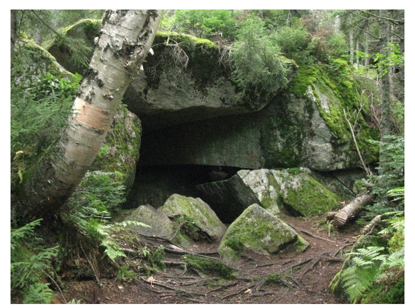
A cave at Piazza Rock