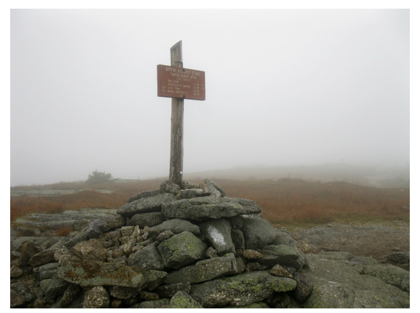
The summit of Saddleback Mountain