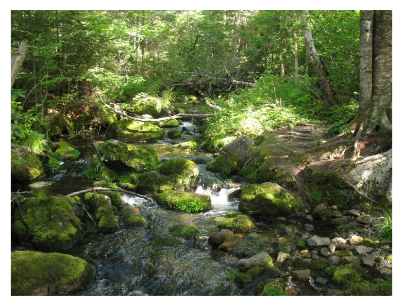
A stream flowing into Orbeton Stream