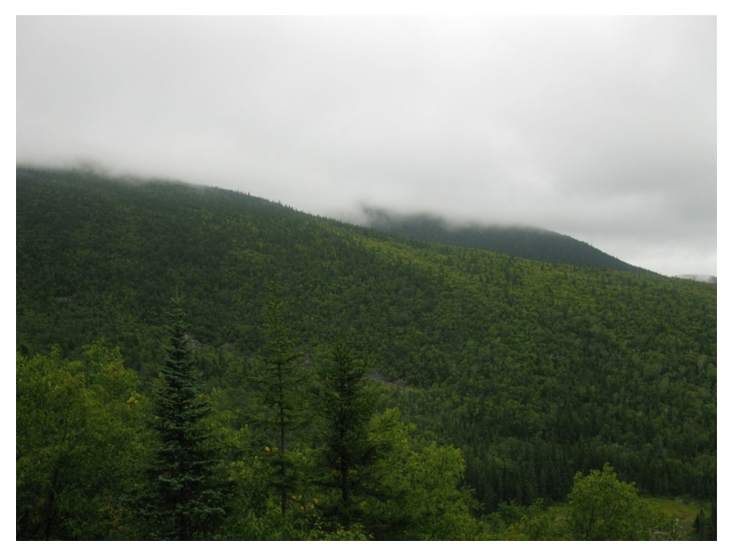
South Crocker Mountain