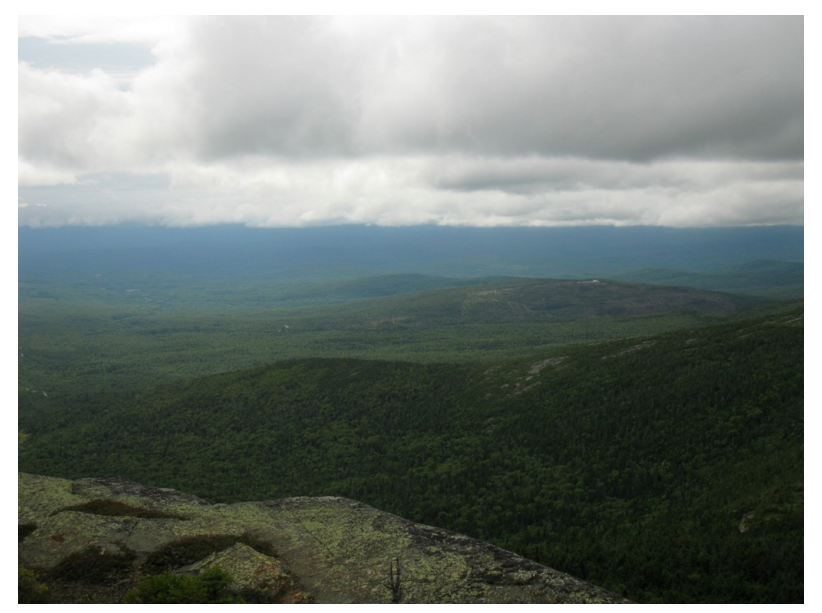
The view east from The Horn