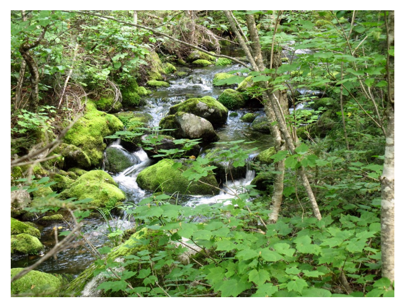
A stream flowing into Orbeton Stream