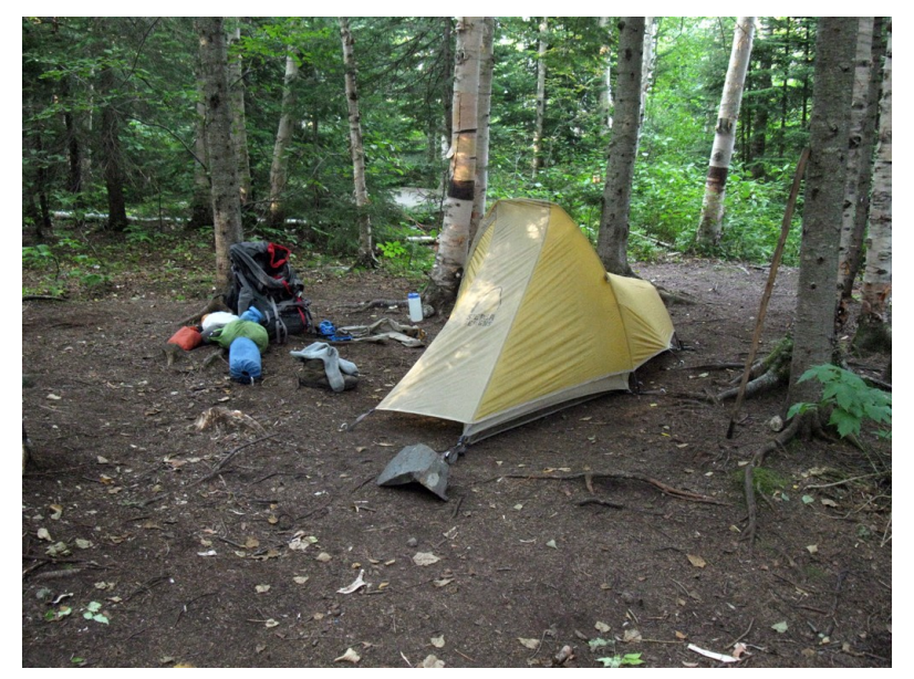
Crocker Cirque Tentsite