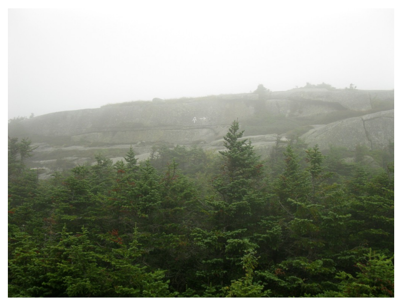
Near the summit of Saddleback Mountain