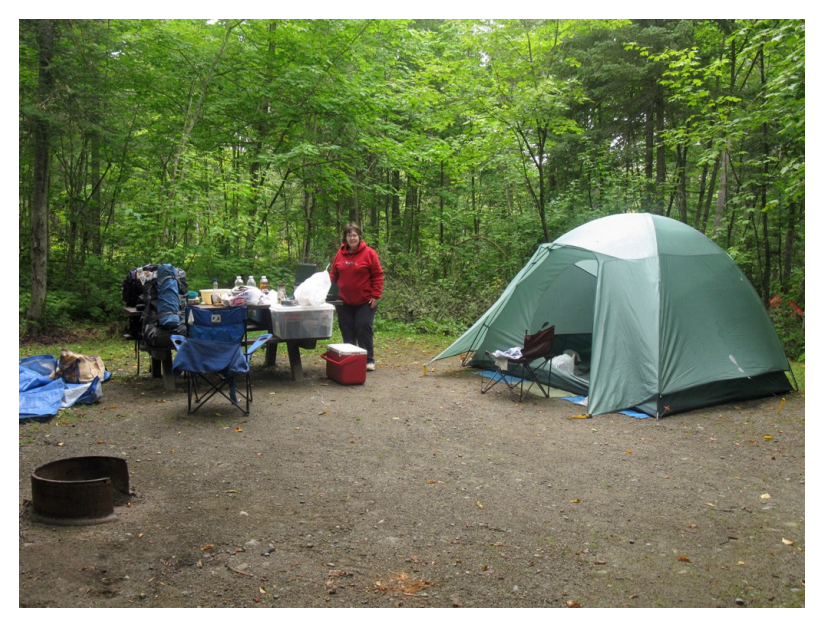
Campsite at Rangeley Lake State Park