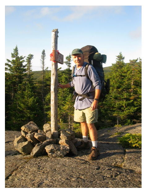
"Sliver" on Poplar Ridge