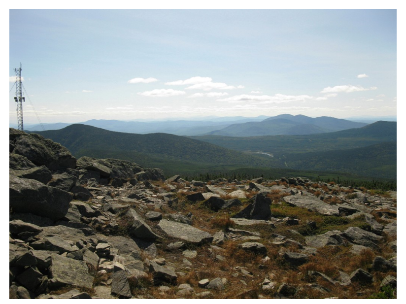
The view west from Sugarloaf Mountain