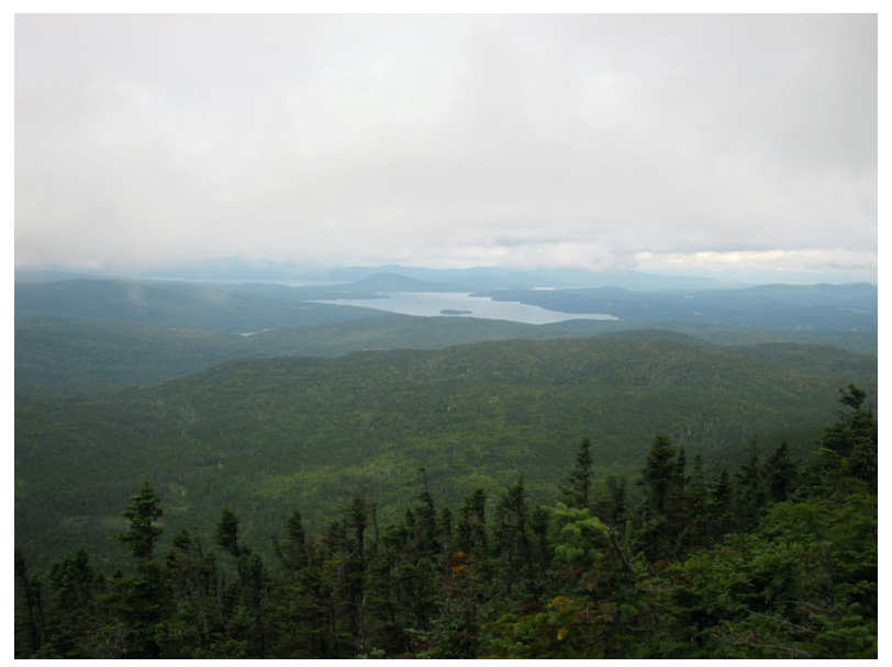
Looking back at Rangeley Lake