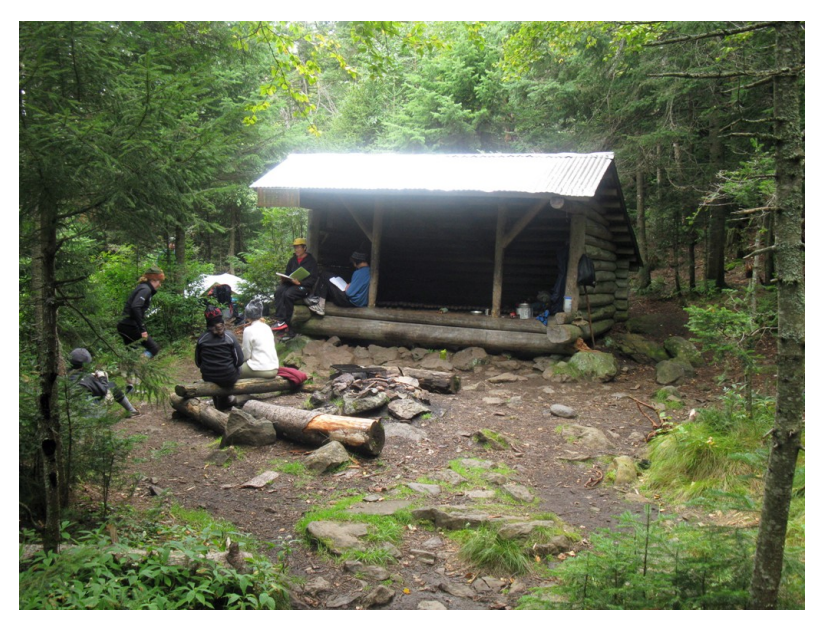
College students at Poplar Ridge Lean-to