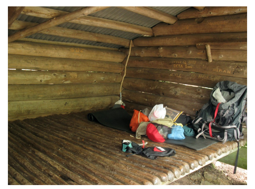
The interior of Poplar Ridge Lean-to