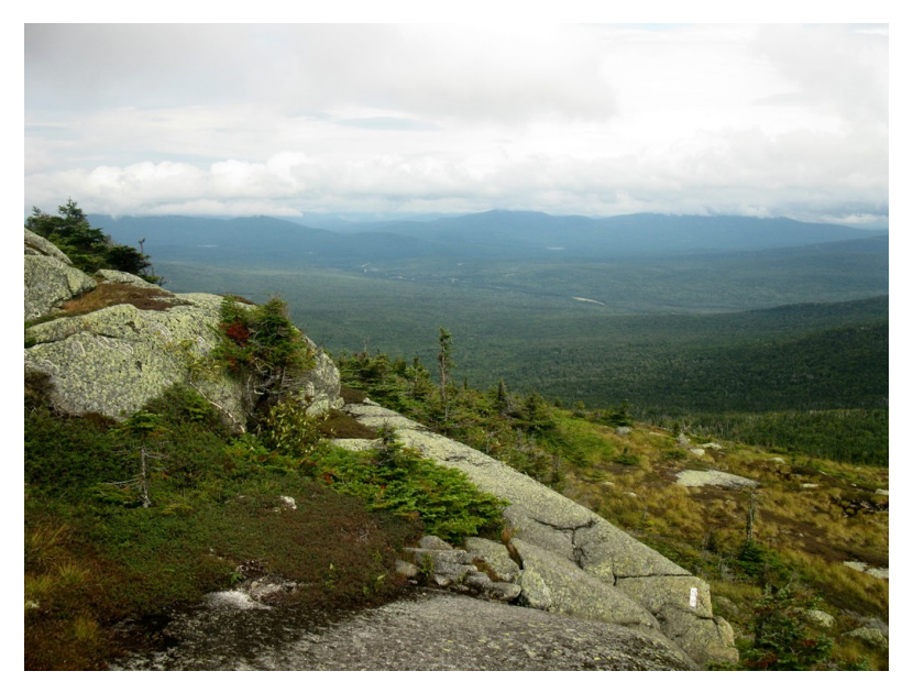
The view west from Saddleback Mountain