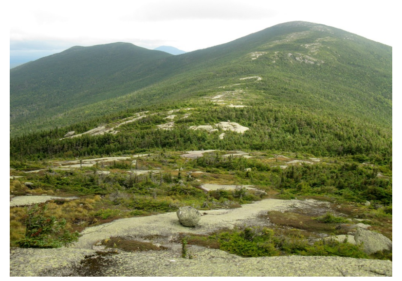
The Horn from Saddleback Mountain