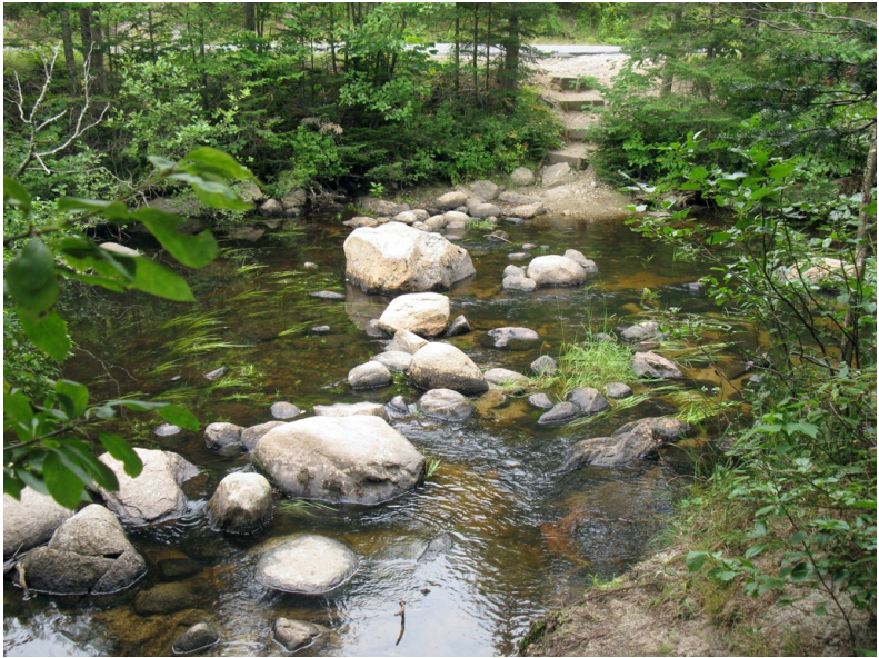
Black Brook and South Arm Road