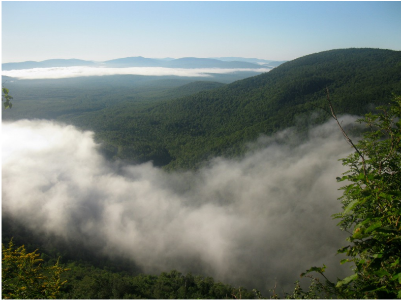
Looking east from Old Blue Mountain