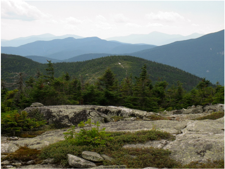
The view north from East Baldpate