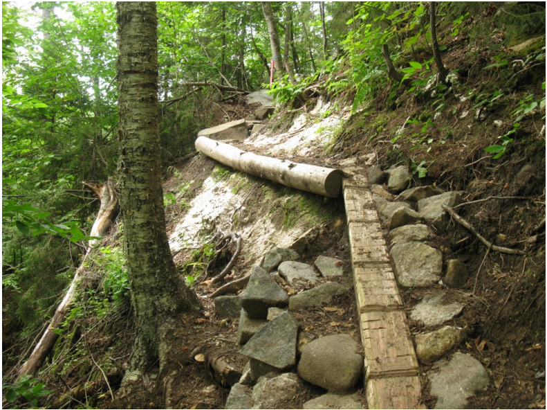
Trail relocation on Moody Mountain