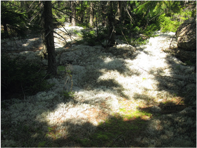
A bed of lichen