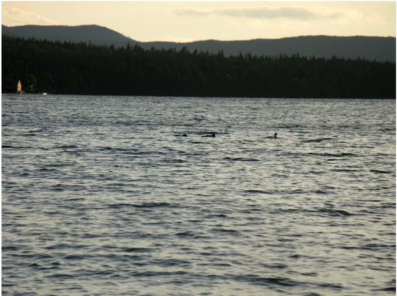
Loons on Long Pond