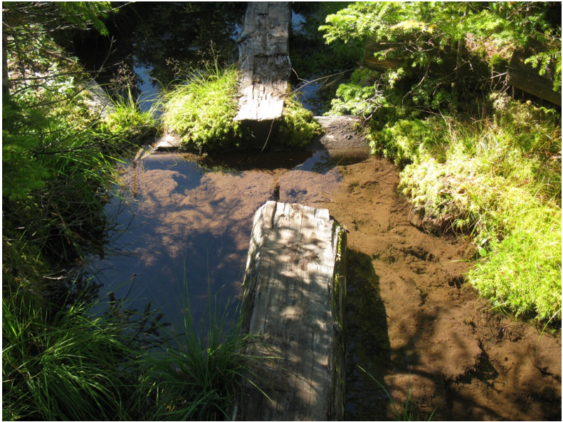
Bog bridge and the bog