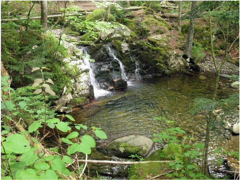
Falls on the West Branch Ellis River