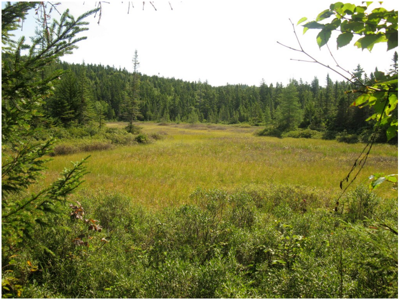
A boreal bog