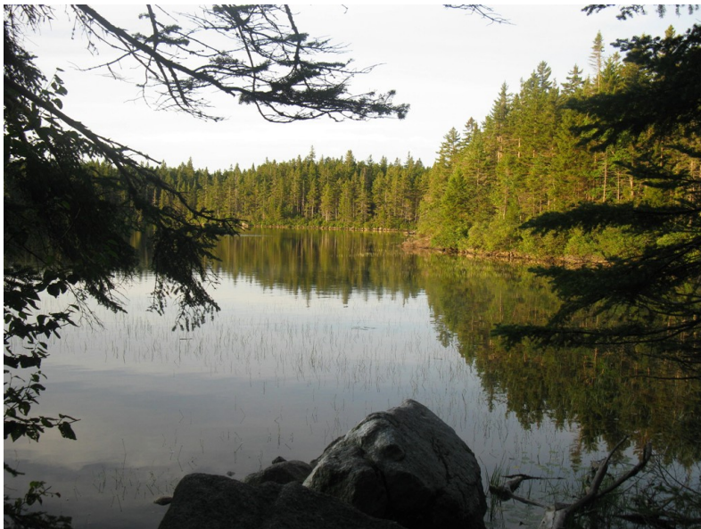
Sabbath Day Pond