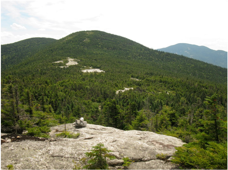
West Baldpate from East Baldpate