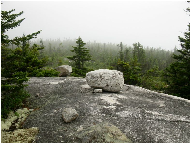
The trail down Bemis Mountain