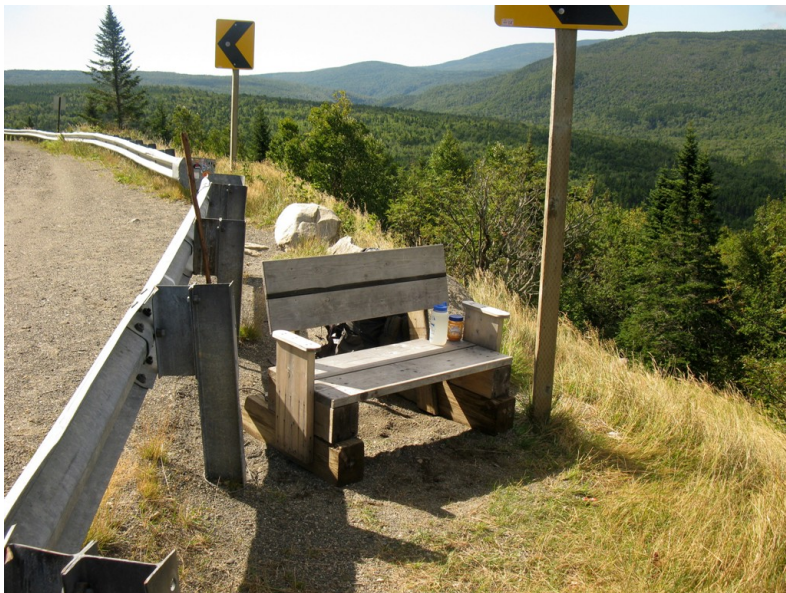
The overlook on Highway 17