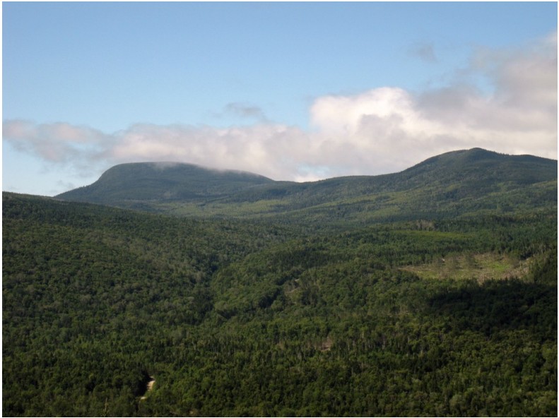
Looking back at Bemis Mountain