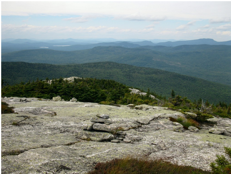
The view west from East Baldpate