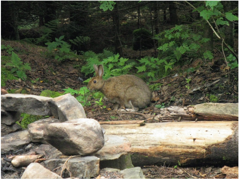
A rabbit at Sabbath Day Pond Lean-to