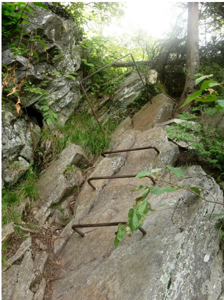
Iron rungs and a railing