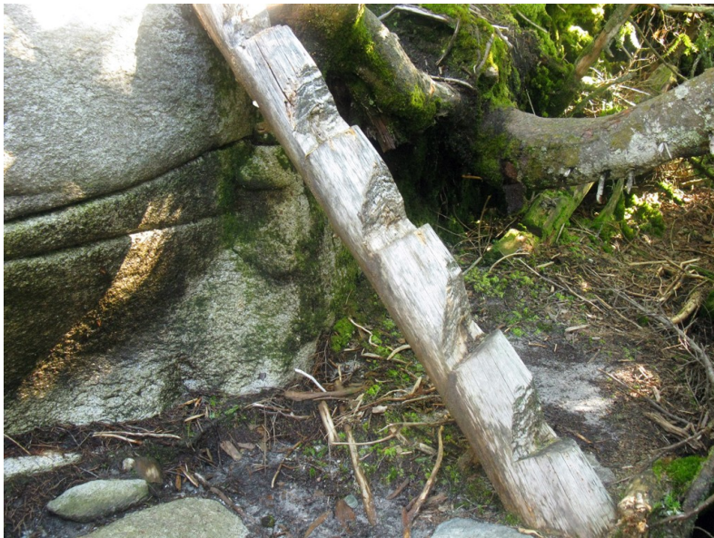
A different kind of ladder