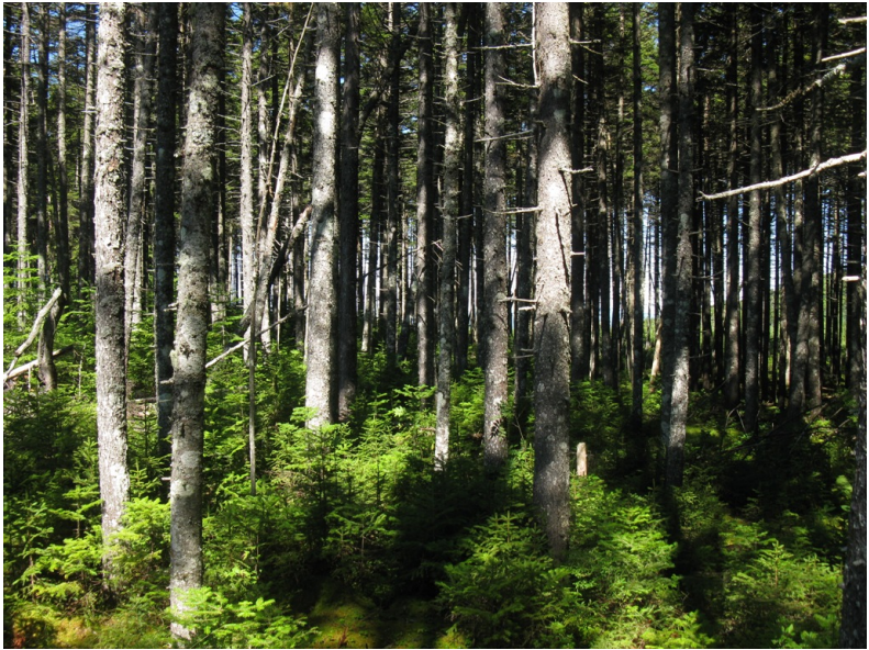
A spruce forest