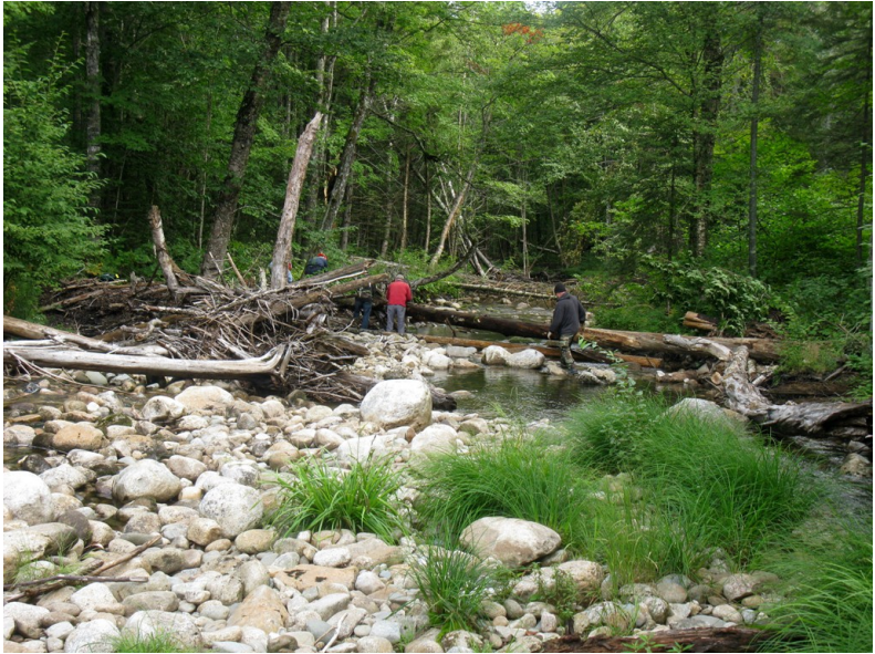
Trail workers building a bridge over Bemis Stream