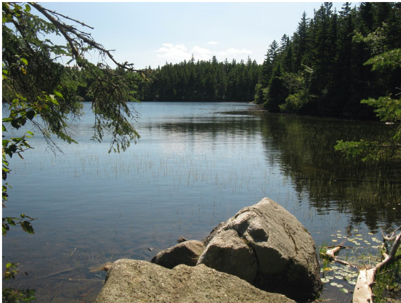
Sabbath Day Pond