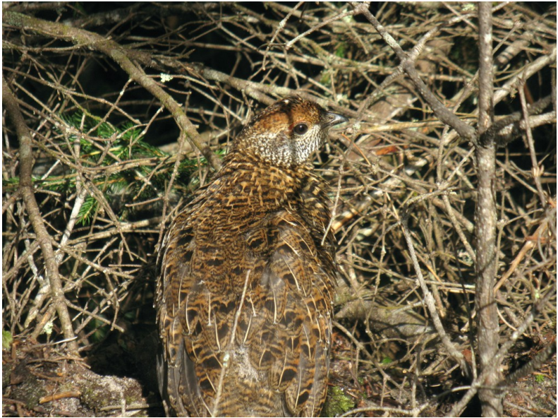
A second grouse in the trail