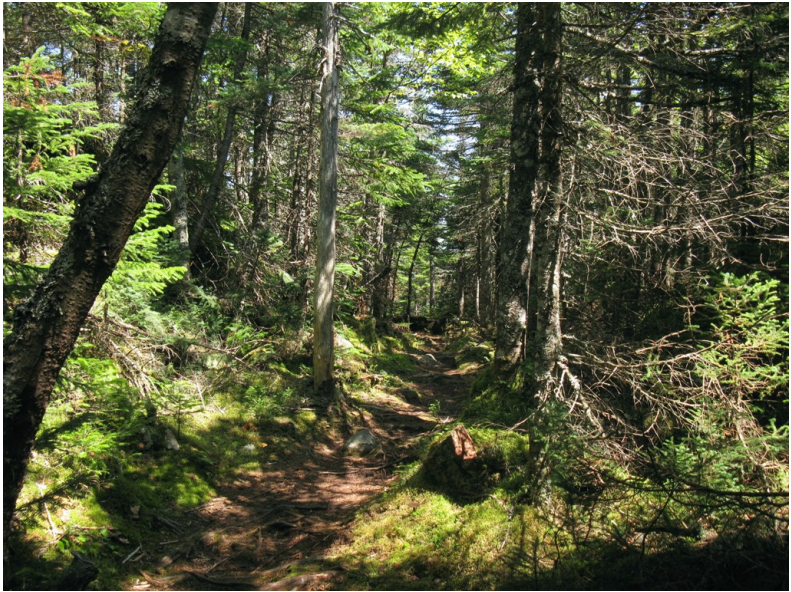
The trail on Bemis Mountain