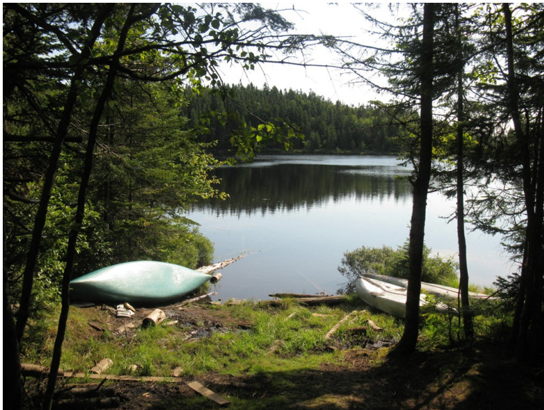
Little Swift River Pond