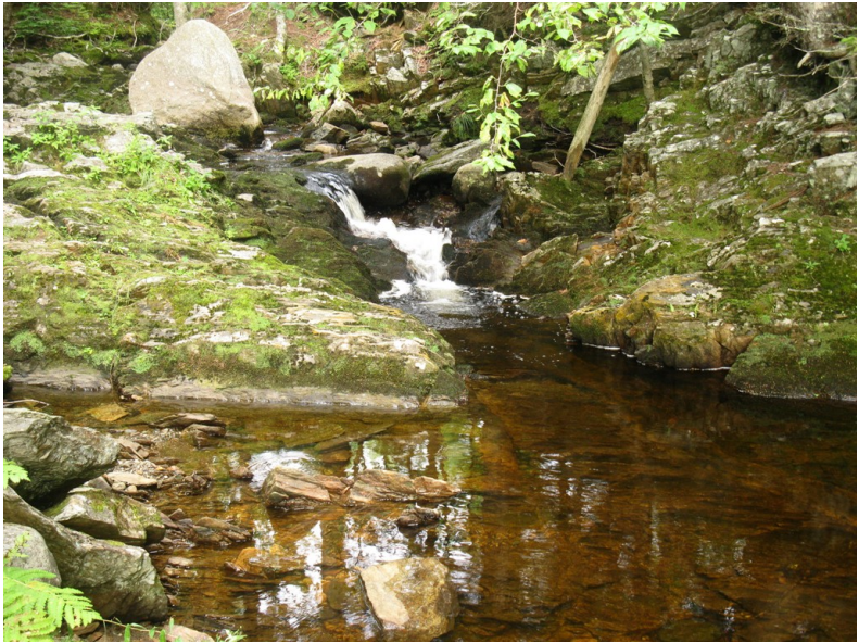
Falls on the West Branch Ellis River