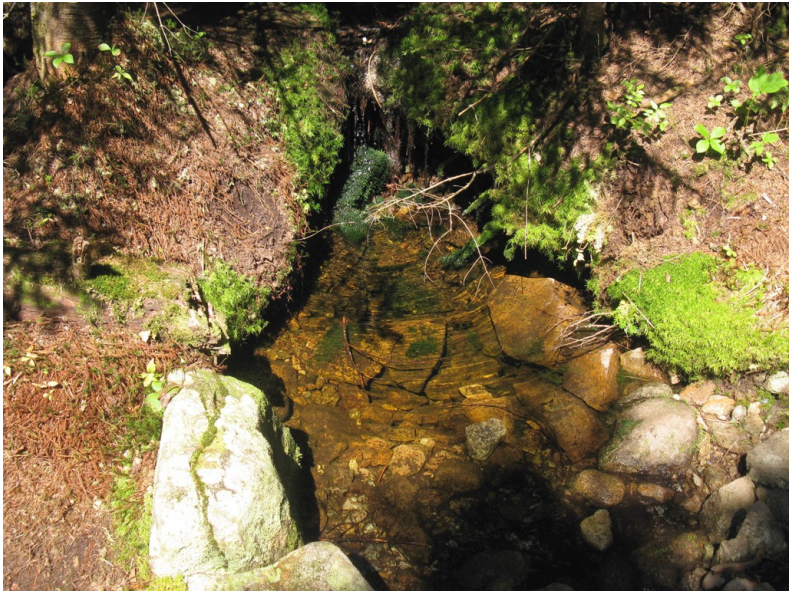
A spring next to the trail