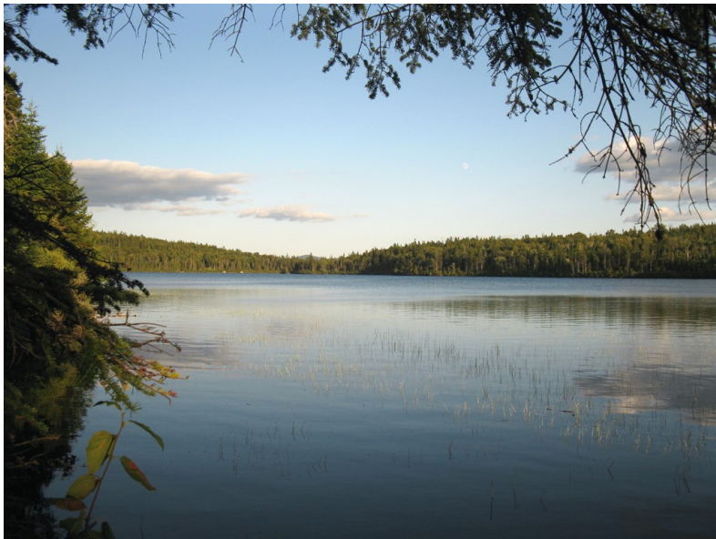
Sabbath Day Pond