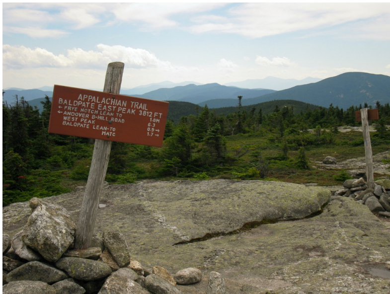
The summit of East Baldpate Mountain