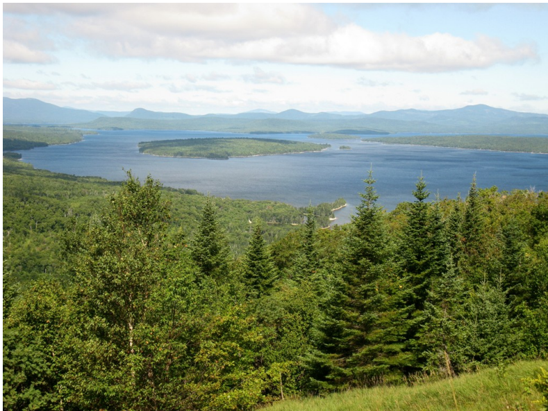
Mooselookmeguntic Lake from Highway 17