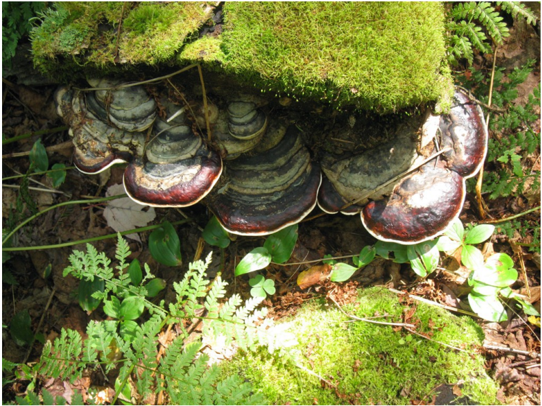
Colorful fungus on a log