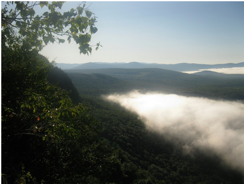
Looking east from Old Blue Mountain