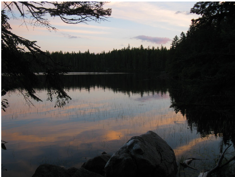
Sabbath Day Pond