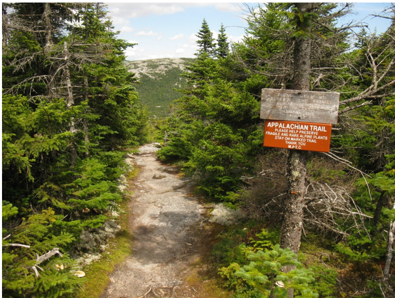
The trail on West Peak of Baldpate Mountain