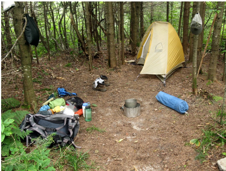
Tentsite at South Arm Road