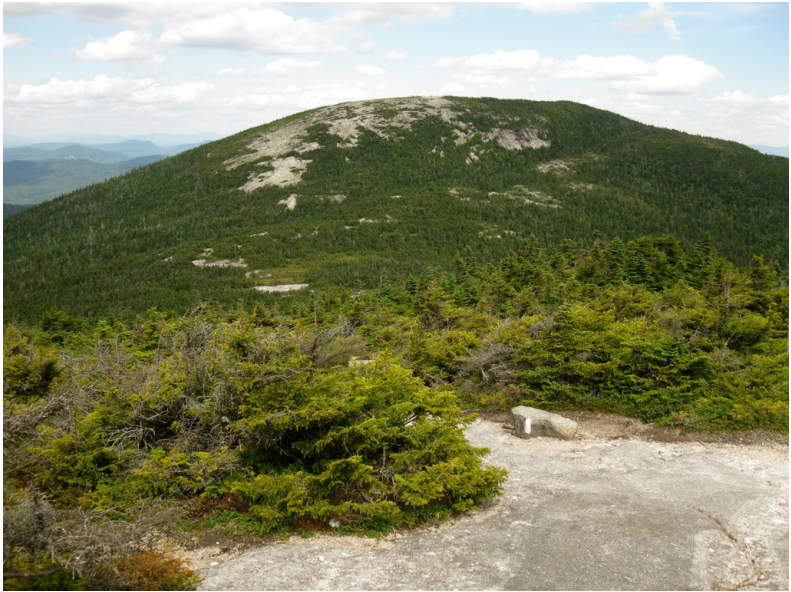
East Peak of Baldpate Mountain