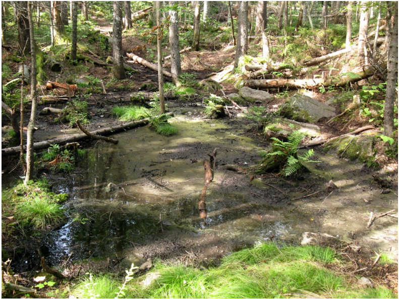
Mud in the trail