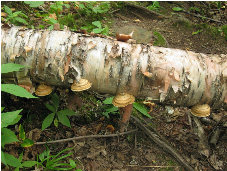
Fungus growing on a log