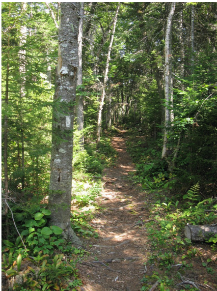
The trail near Highway 4