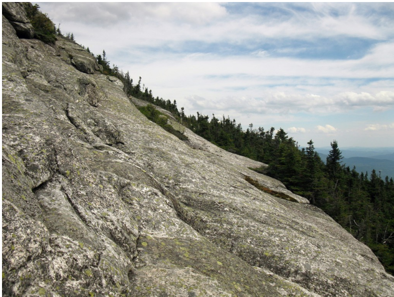
The trail up East Baldpate Mountain