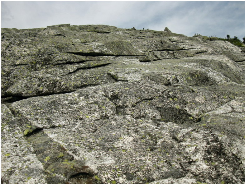
The trail up East Baldpate Mountain