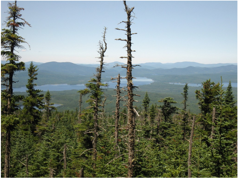
The view west from Bemis Mountain