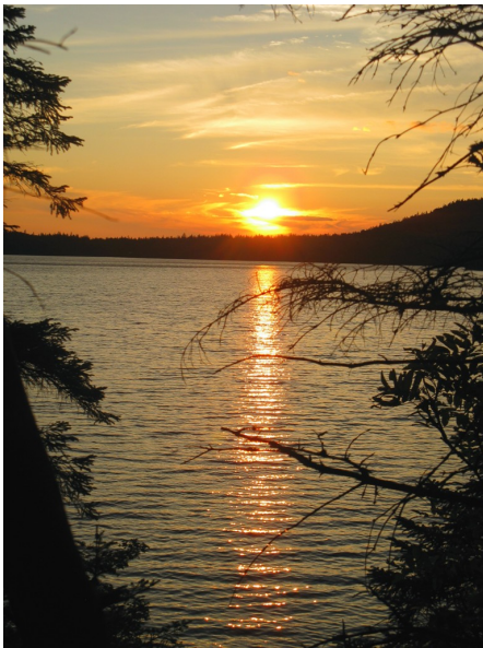
Sunset over Long Pond