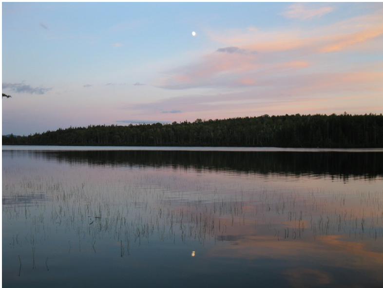
Moonrise over Sabbath Day Pond