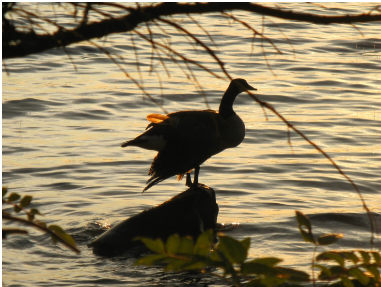
A goose roosting on a rock in Long Pond