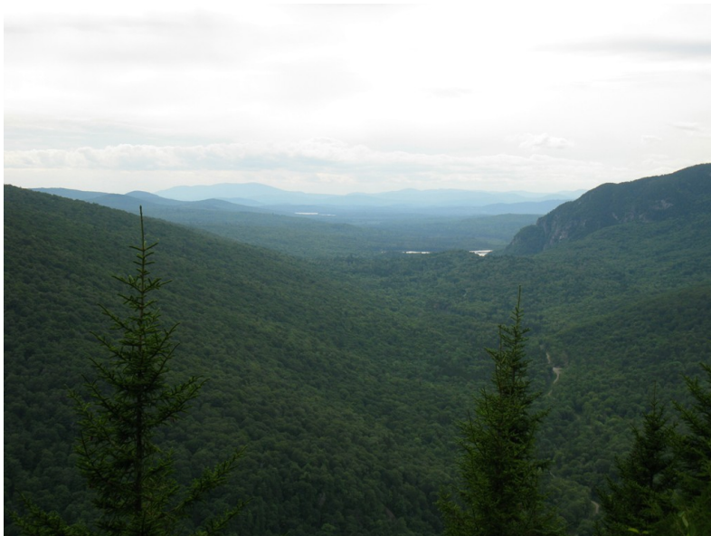
The view west from Moody Mountain