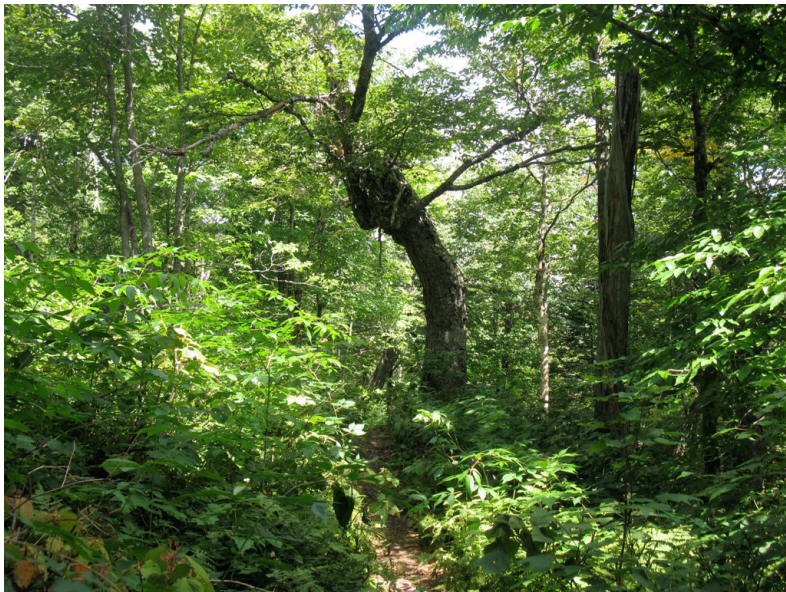
The trail past a gnarled maple tree