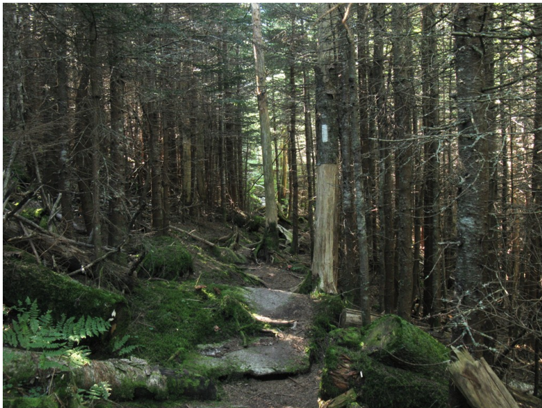
The trail through a hemlock forest