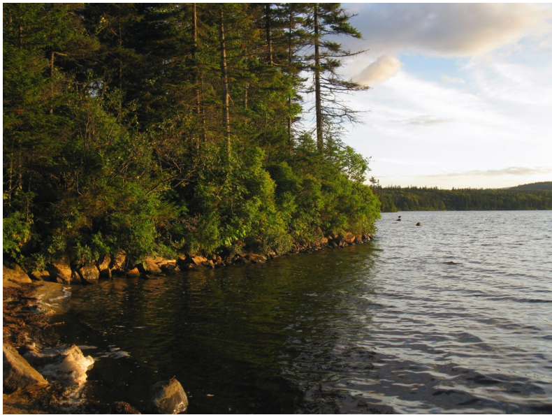
North shore of Long Pond