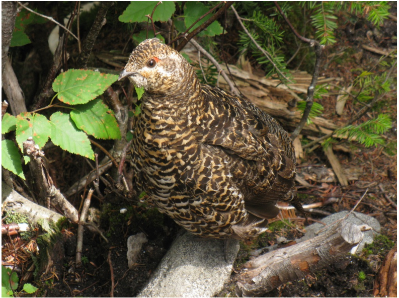
A grouse in the trail