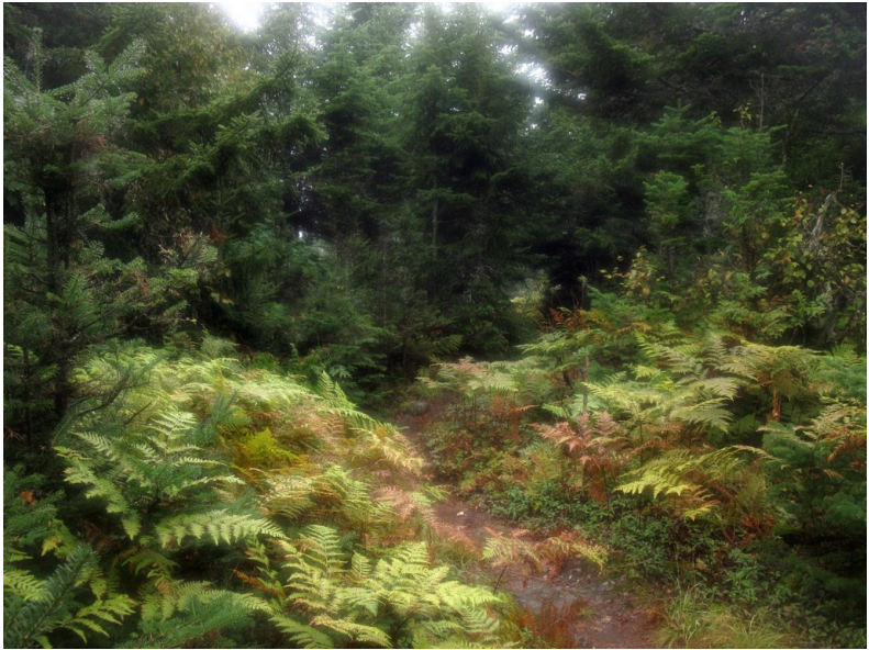
The trail on Gulf Hagas Mountain