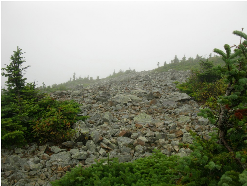
The view from White Cap Mountain