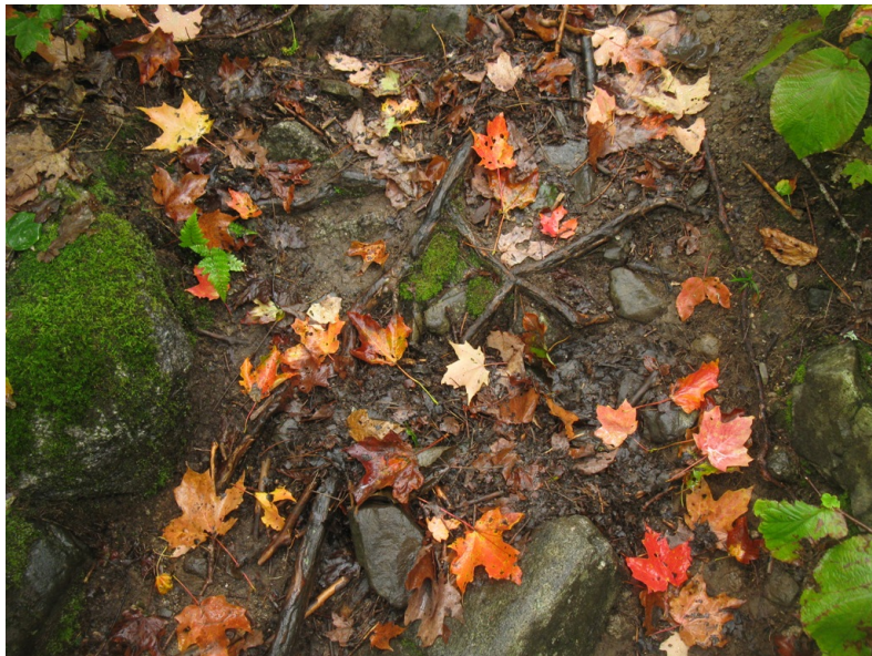
Fall colors in the trail