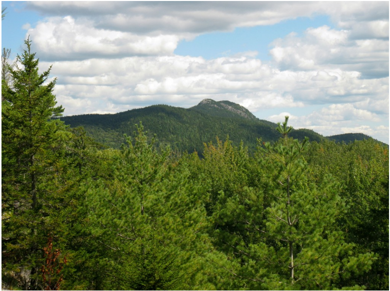
Boarstone Mountain from Big Wilson Cliffs