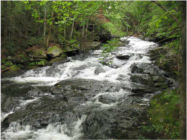
Cooper Brook Falls