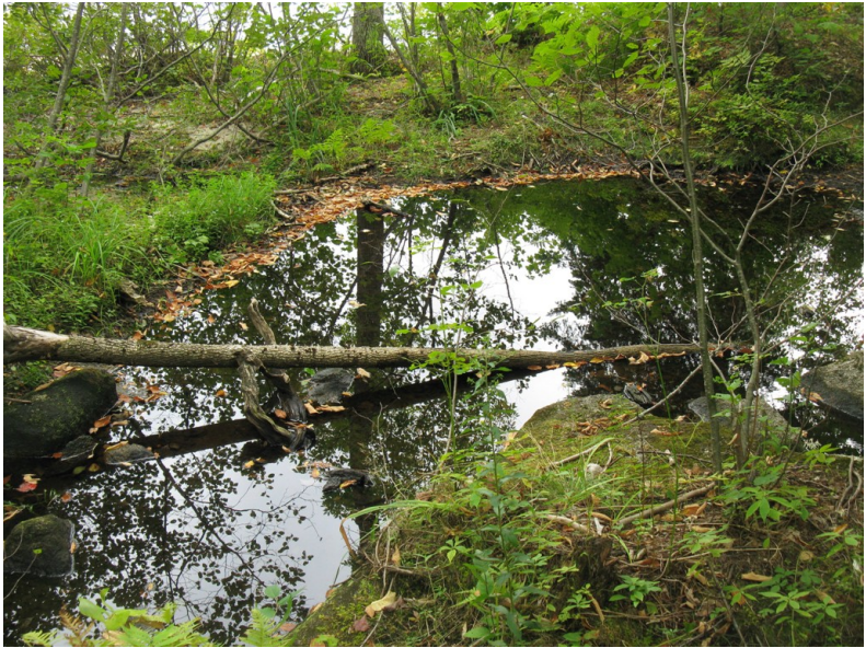
Pool of water next to Lower Jo-Mary Lake