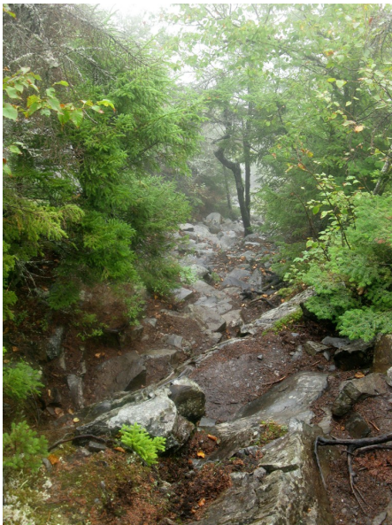
A very steep descent down Chairback Mountain