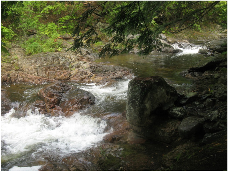
Long Pond Brook