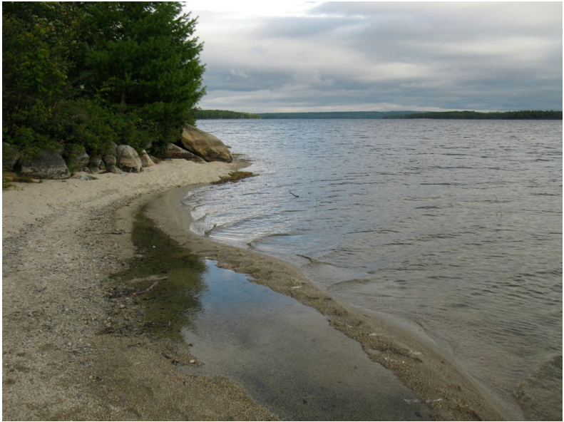
Lower Jo-Mary Lake