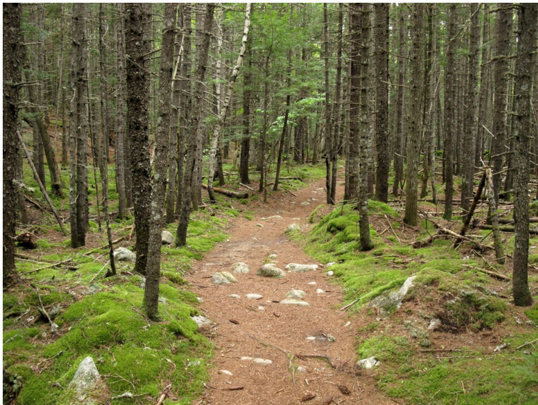
The trail along Cooper Brook