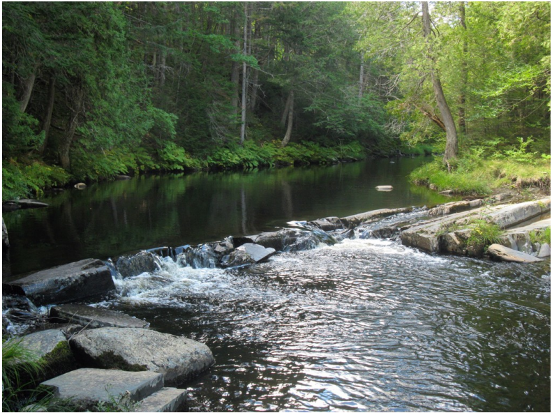
Little Wilson Stream