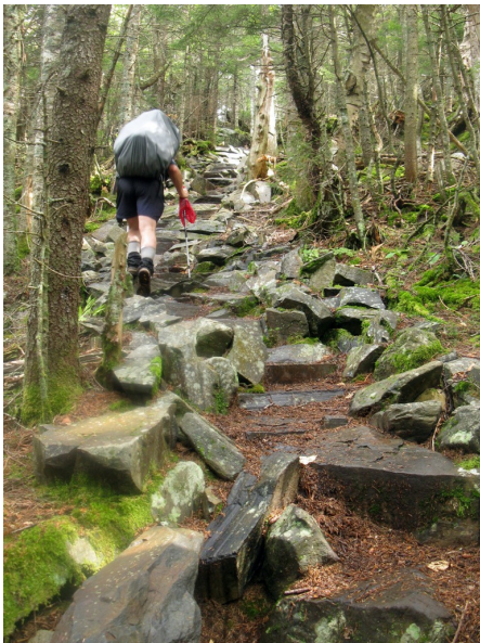
The trail up Barren Mountain