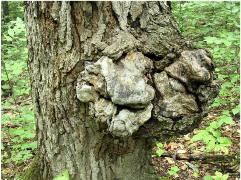
A gnarly tree