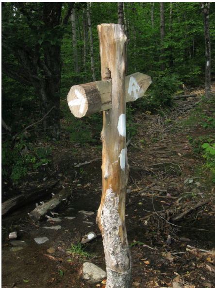
Interesting trail sign