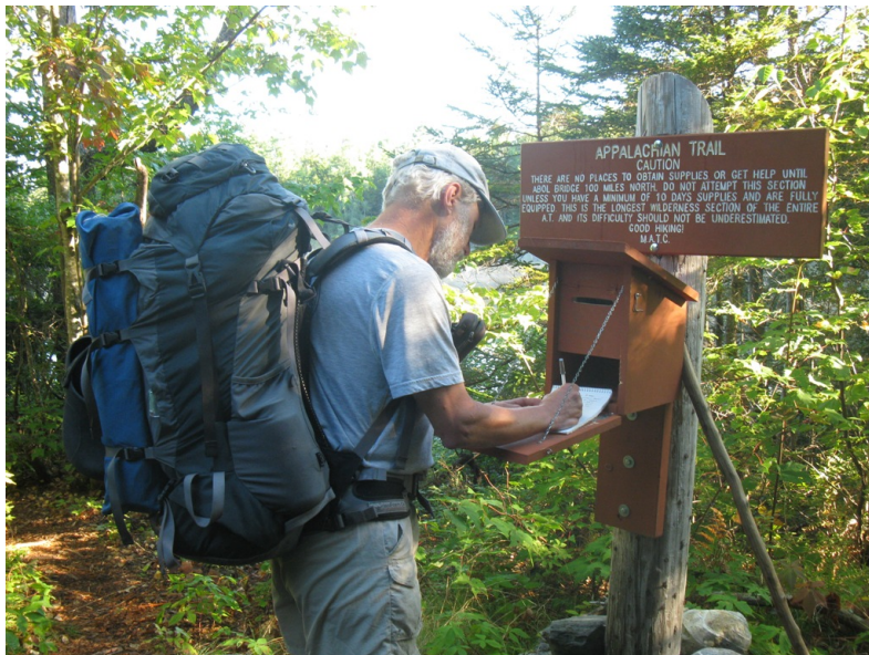
Signing in to the 100-mile wilderness