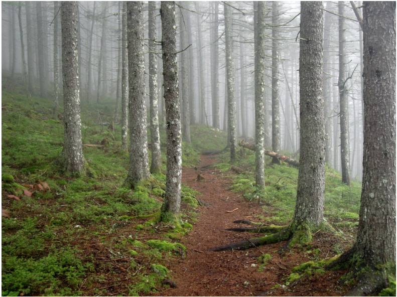
The trail on Chairback Mountain