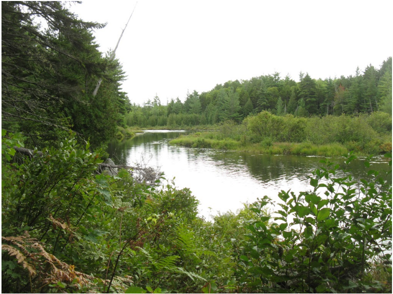
Deadwater along Cooper Brook