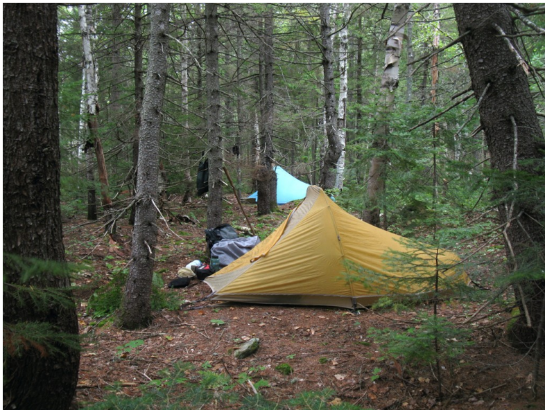
Tentsite at Mountain View Pond