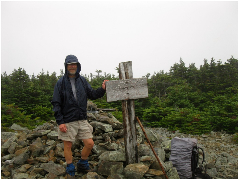
On the summit of White Cap Mountain