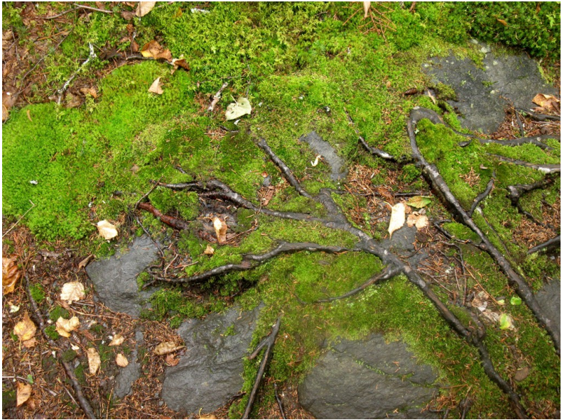
Roots, moss, and rocks