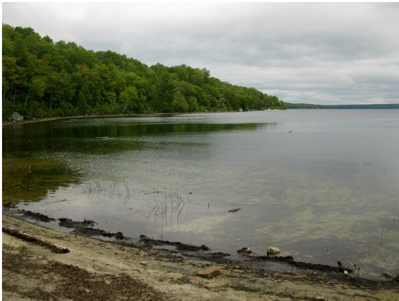
Lower Jo-Mary Lake