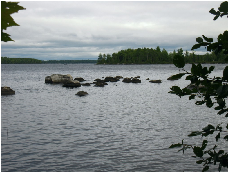
Lower Jo-Mary Lake