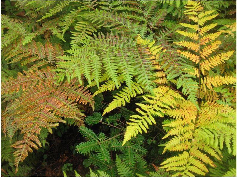
Fall colors in ferns