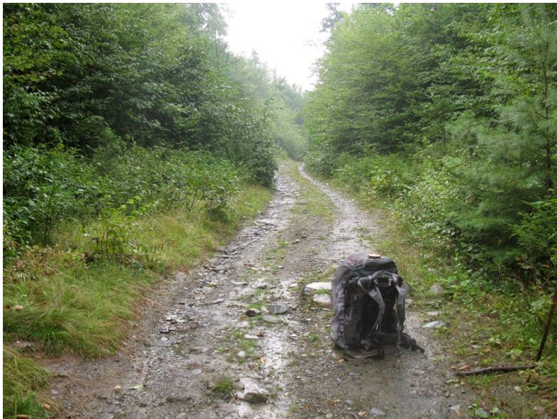
Crossing a woods road in the rain