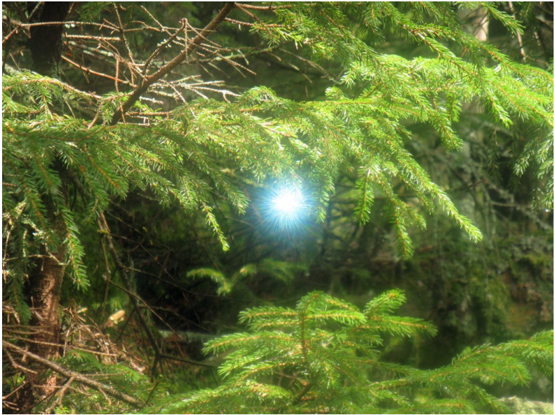
Sunlight refracted in a raindrop