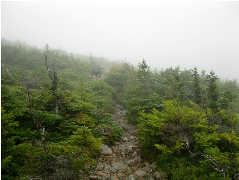
The trail on White Cap Mountain