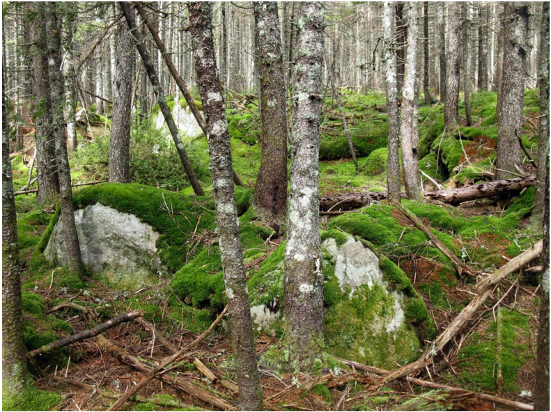
The moss-covered forest floor