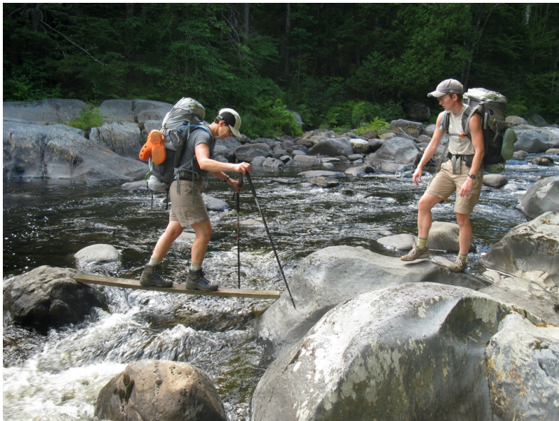
“Roots” crossing Big Wilson Stream