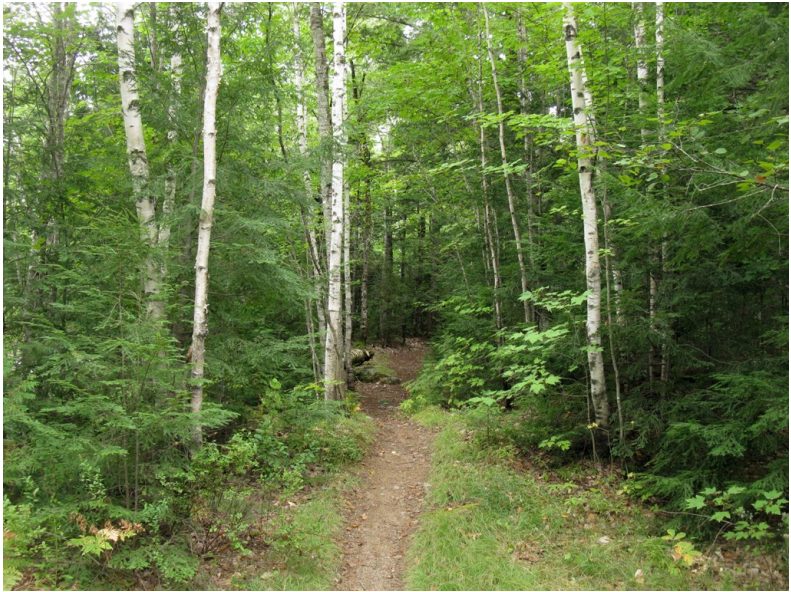
The trail through white birches