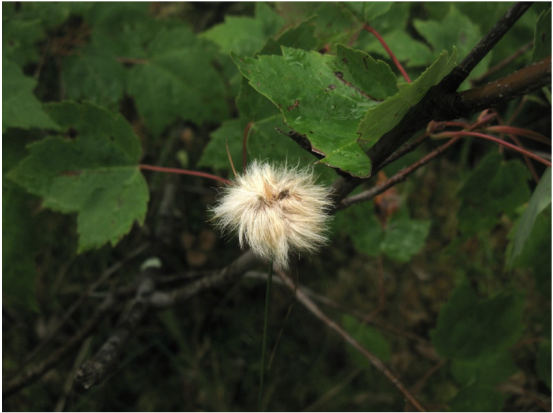
A seed pod in Fourth Mountain Bog