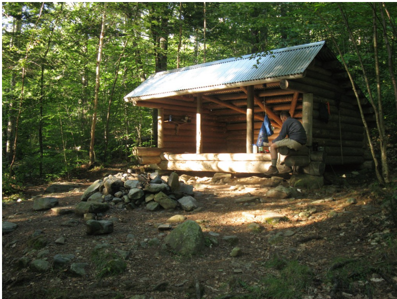
Wilson Valley Lean-to