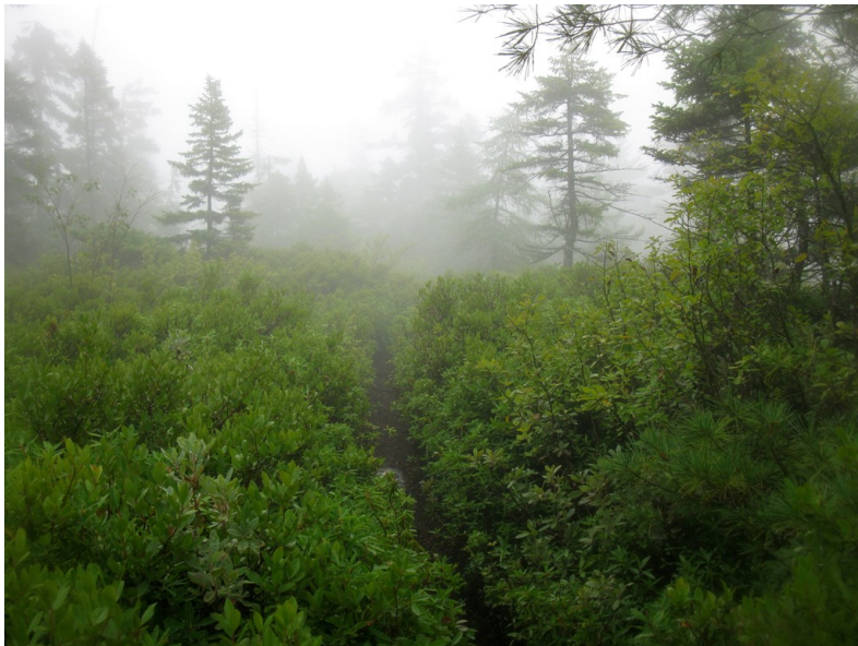
The trail on Chairback Mountain