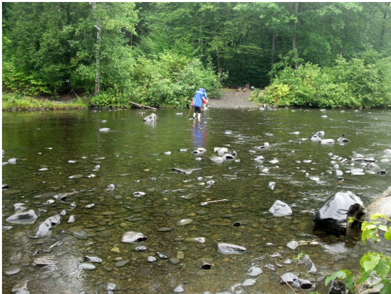
Hikers fording West Branch Pleasant River