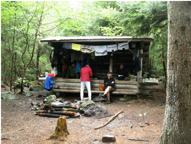
Carl A. Newhall Lean-to