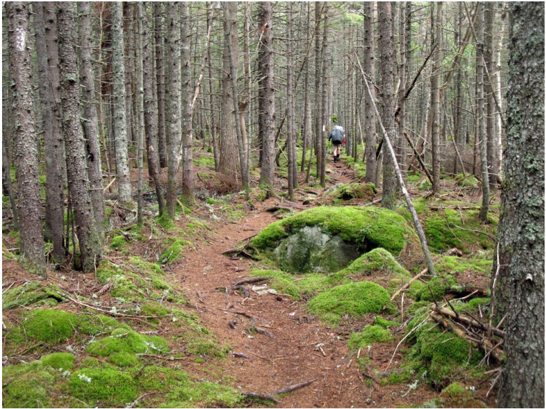
The trail through a hemlock forest