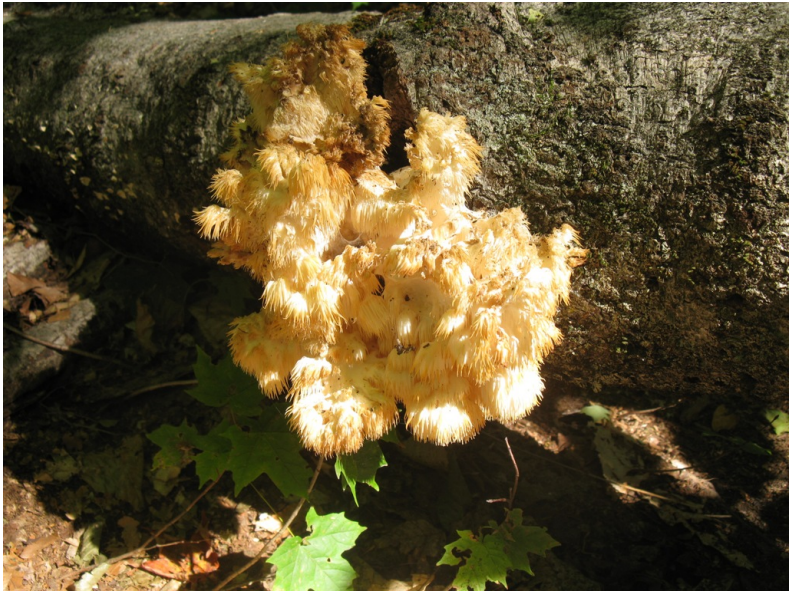
Fungus on a log