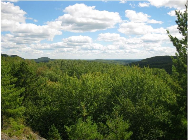
The view south from Big Wilson Cliffs