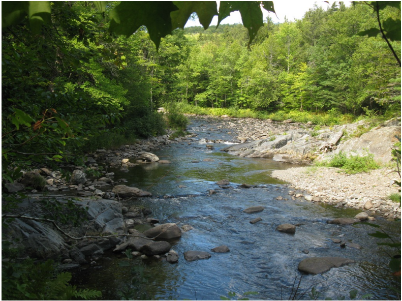
Big Wilson Stream