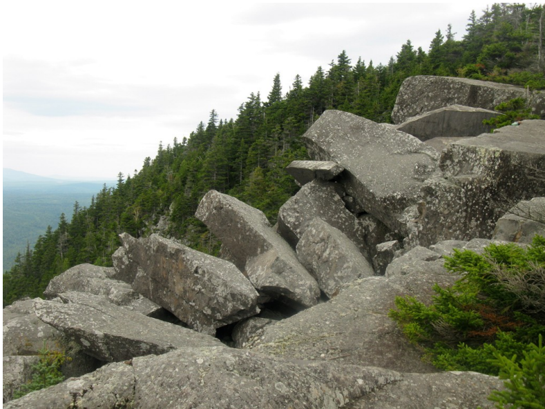
The rocks above Barren Slide