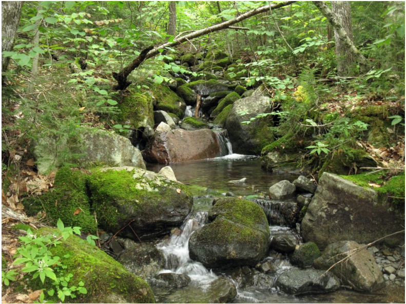
A side stream near Cooper Brook