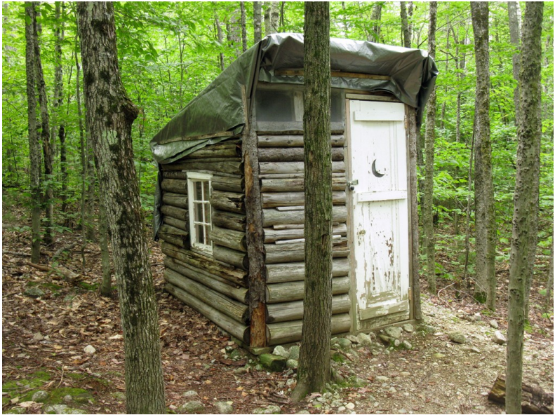
The privy at Antlers Campsite