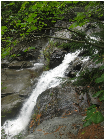
Falls on Wilber Brook