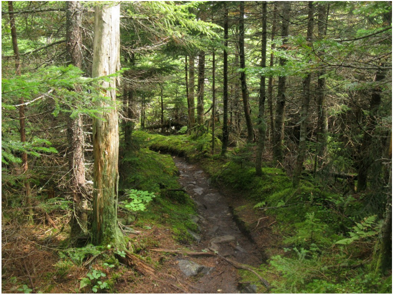
The trail on Barren Mountain