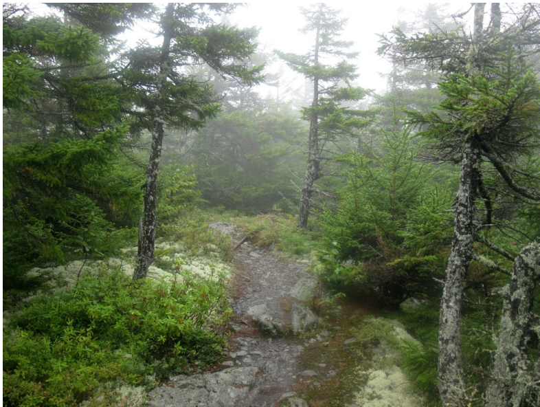
The trail on Chairback Mountain