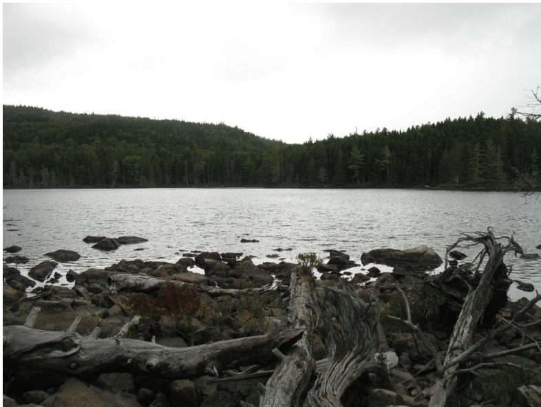
Mountain View Pond