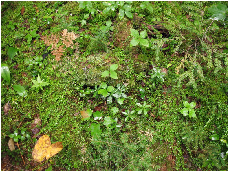
Diverse ground cover