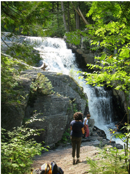
Little Wilson Falls