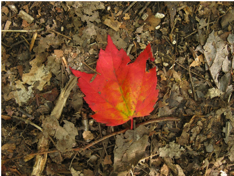
Fall colors in the trail