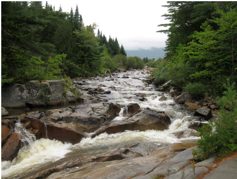
Little Niagara Falls on Nesowadnehunk Stream