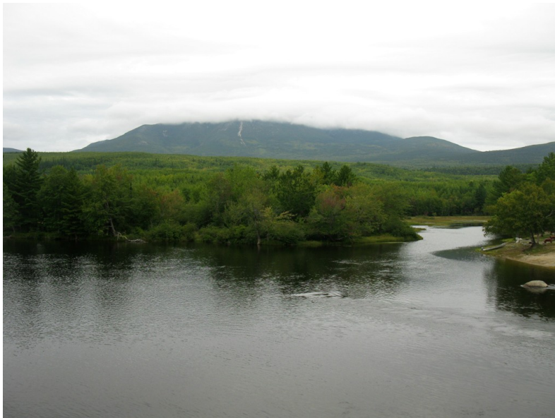
Mt. Katahdin from Abol Bridge