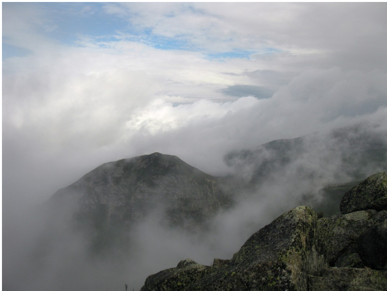
The view west of The Owl