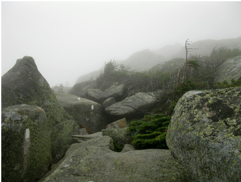
The trail over the boulders