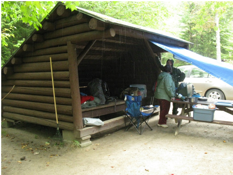
The shelter at the Katahdin Stream Campground