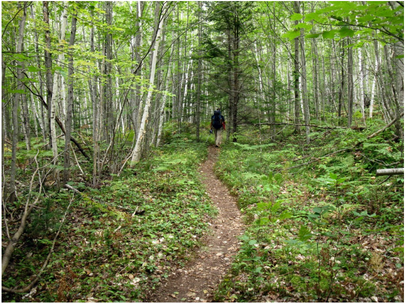
The trail along the Penobscot River