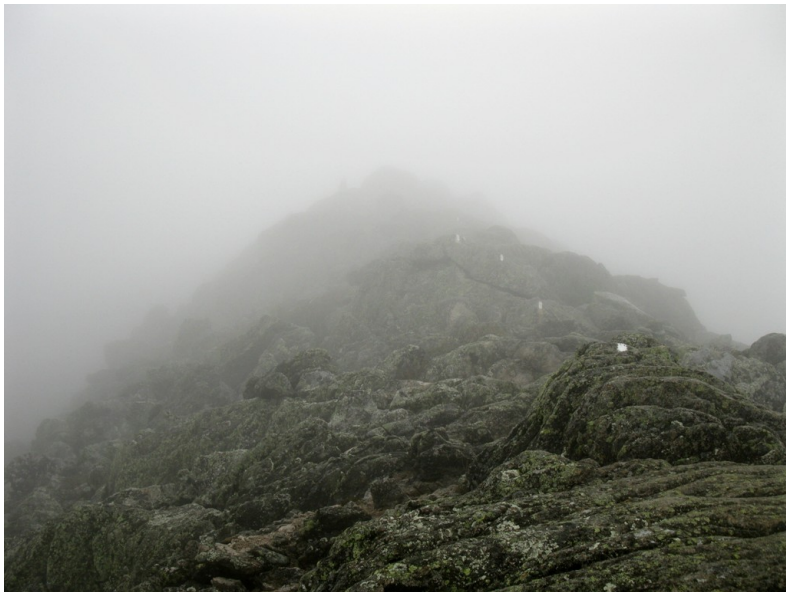
The trail over the boulders