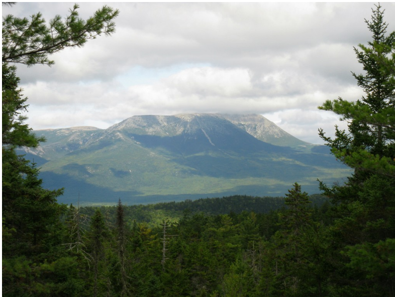
Mt. Katahdin from Rainbow Ledges