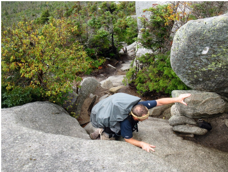
“Frenchy” climbing over the boulders