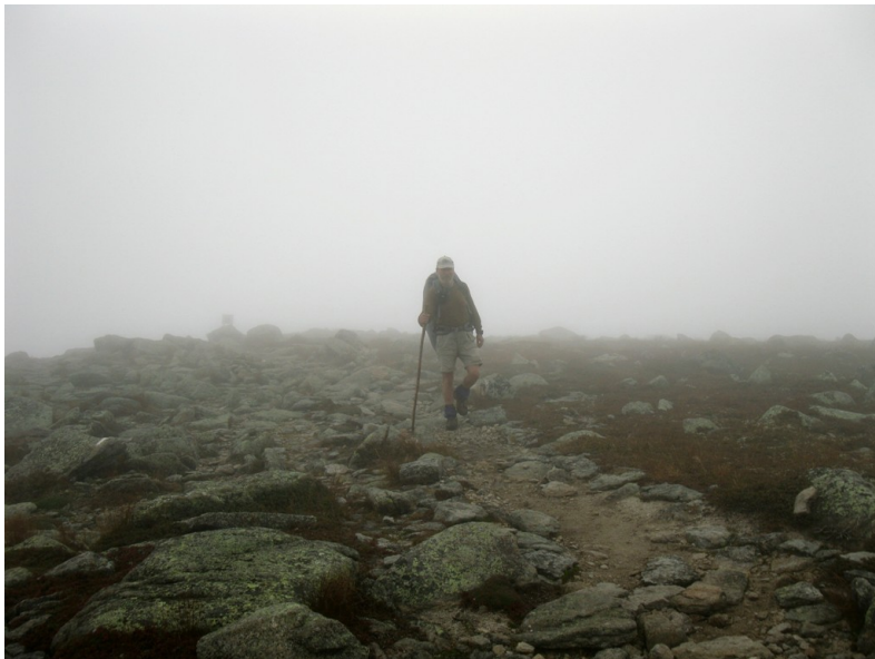
Reaching the Tableland