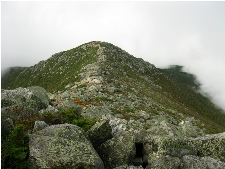
Looking back down the ridge