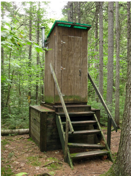
The privy at Hurd Brook Lean-to