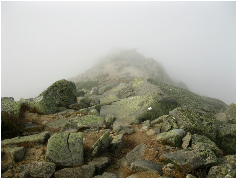
The trail on the ridge