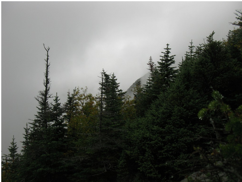
The view west from the trail