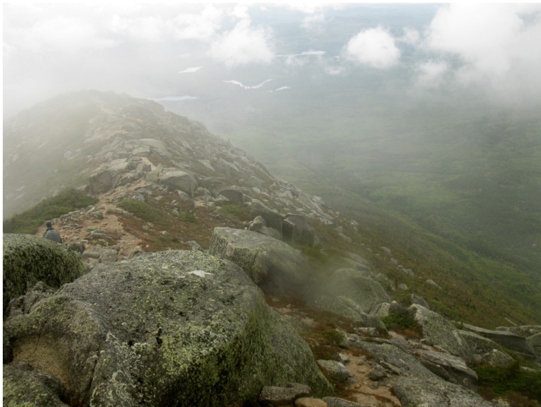
The view south