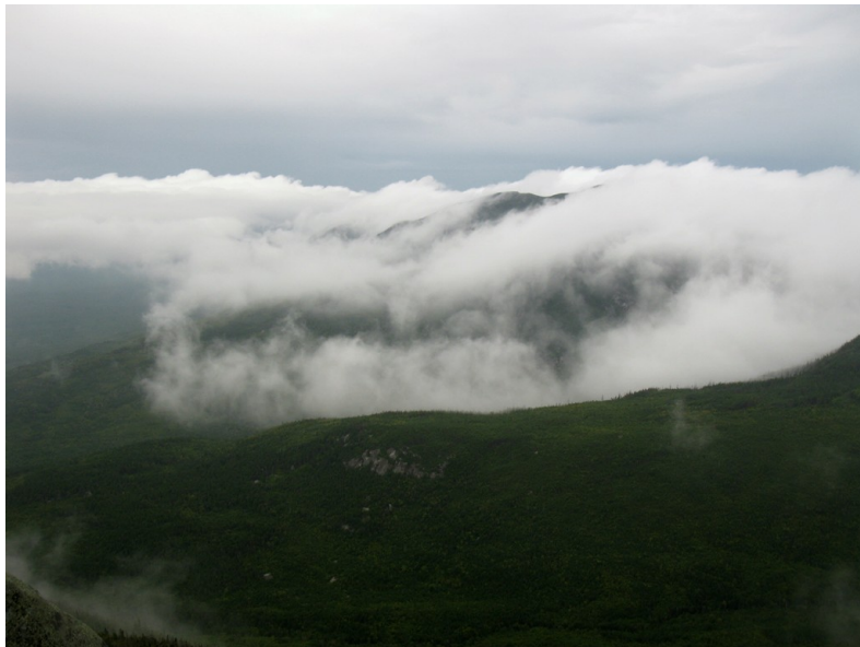
The view southwest