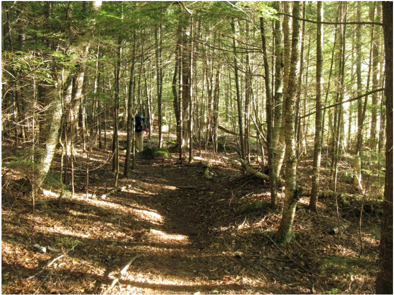
The trail near Pemadumcook Lake