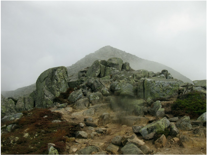
Looking back up the ridge