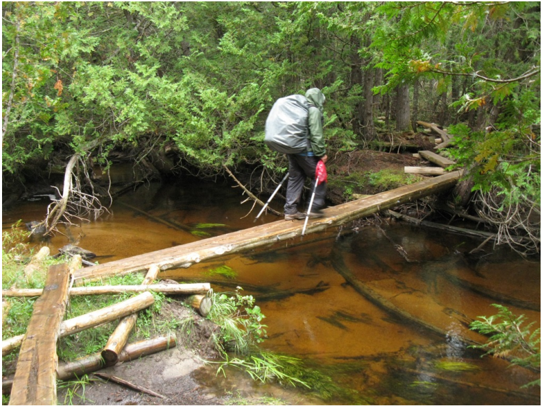
“Frenchy” crossing Katahdin Stream