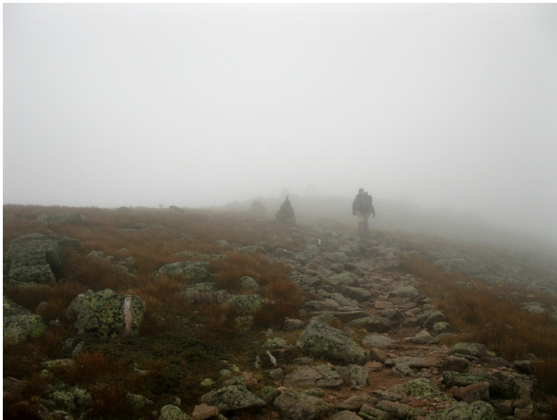
Nearing the summit