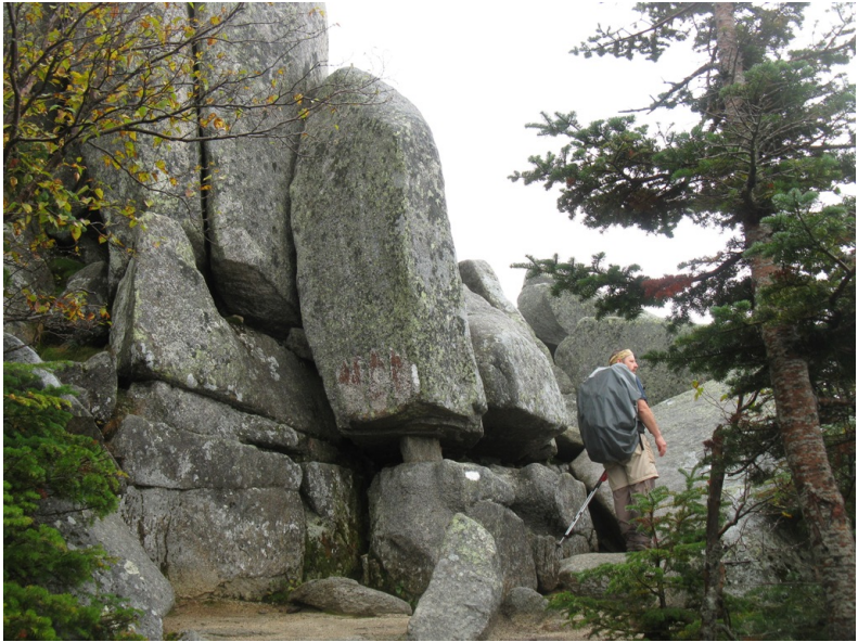
Reaching treeline and the boulders