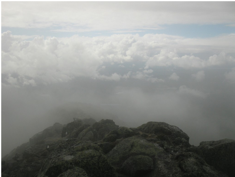
Descending from the Tableland