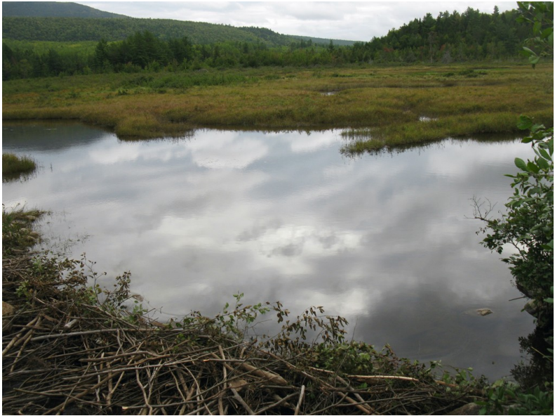
Beaver pond near the trail