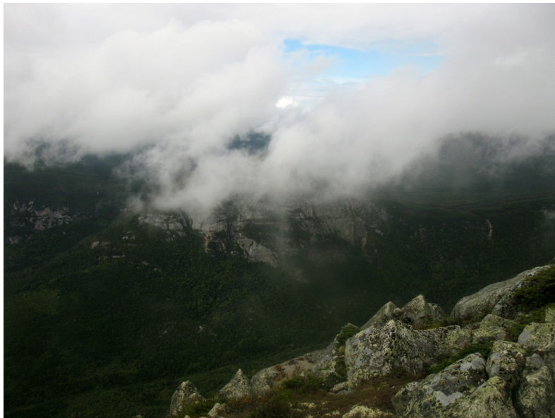
The view west