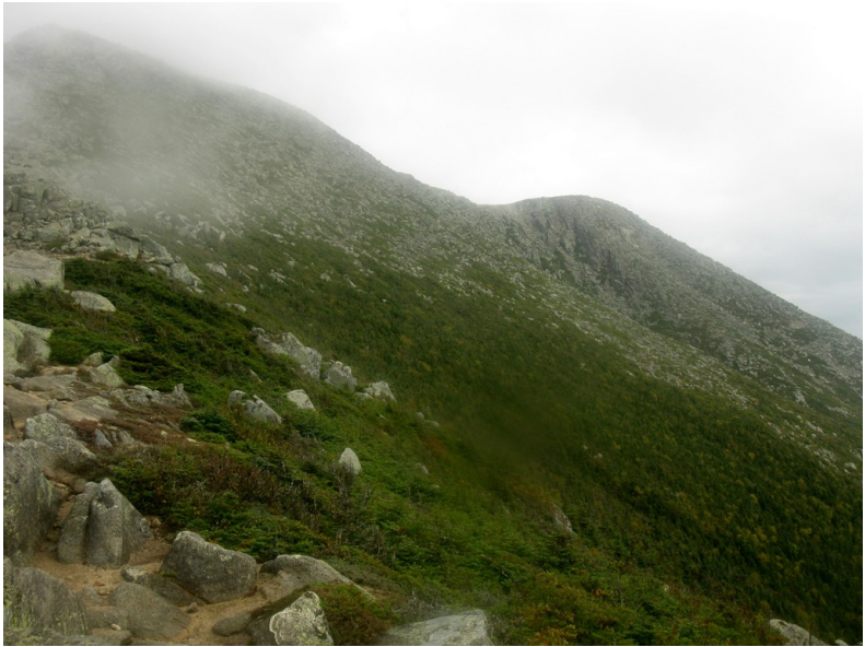
The east side of Mt. Katahdin