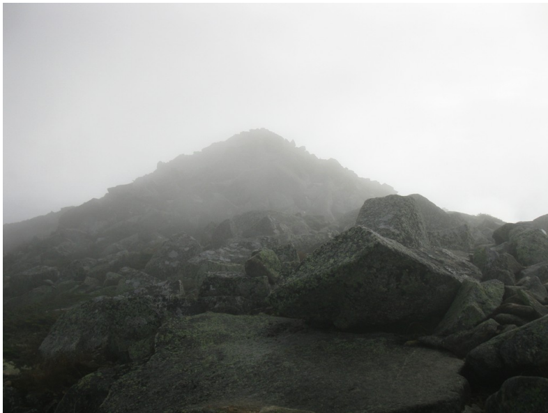
Looking ahead up the ridge