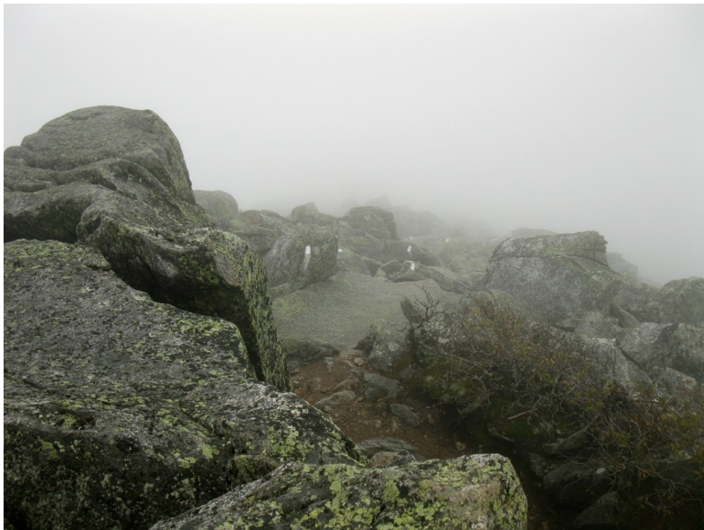
The trail over the boulders