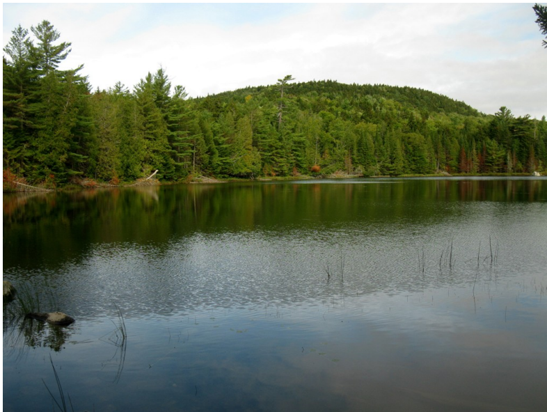
Deadwater on Rainbow Stream