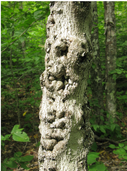
A gnarled beech tree