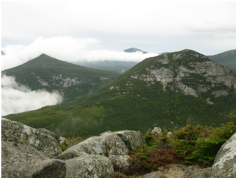
The view west of The Owl