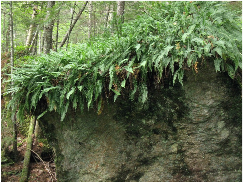
A boulder crowned with ferns