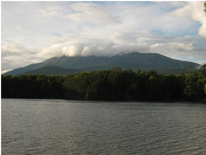
Looking back at Mt. Katahdin on our way home