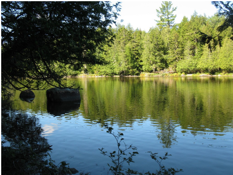
Deadwater on Nahmakanta Stream