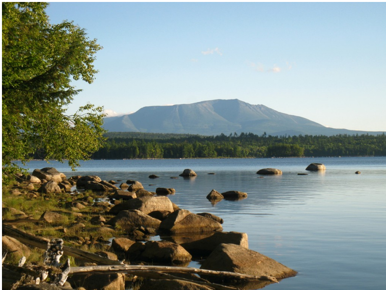
Mt. Katahdin from Pemadumcook Lake