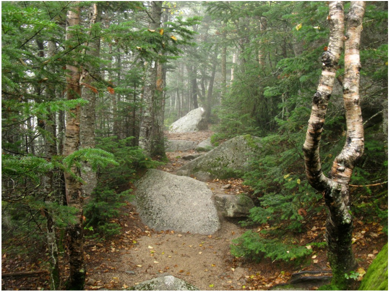
The trail up Mt. Katahdin