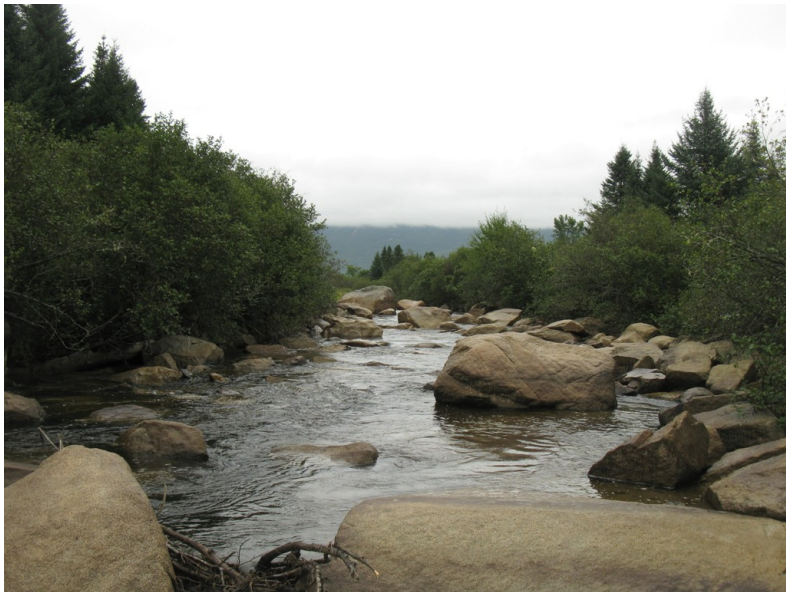
Nesowadnehunk Stream at the toll dam