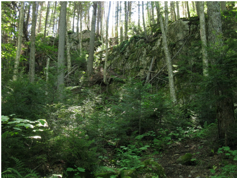
Cliffs on Nesuntabunt Mountain