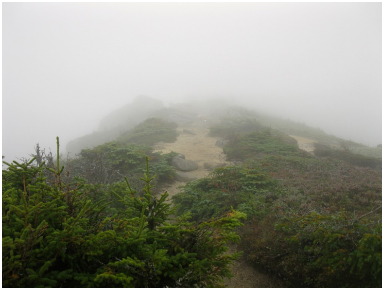
The trail on the ridge