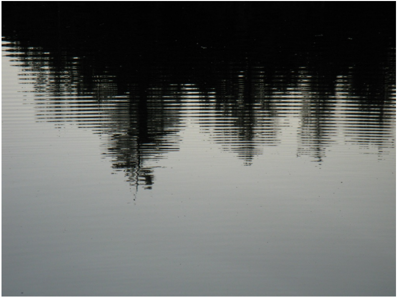
Ripples on Crescent Pond