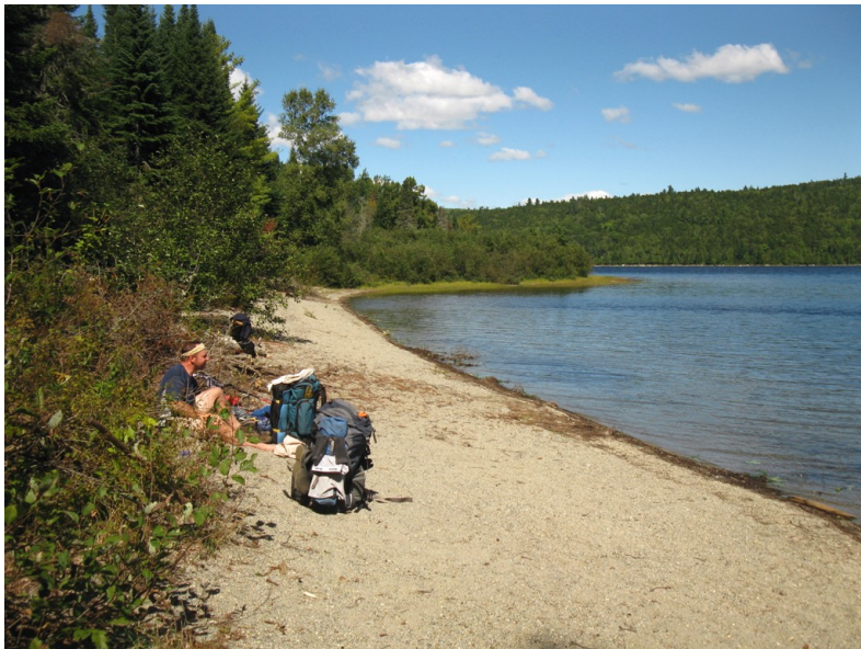
Sandy beach on Nahmakanta Lake