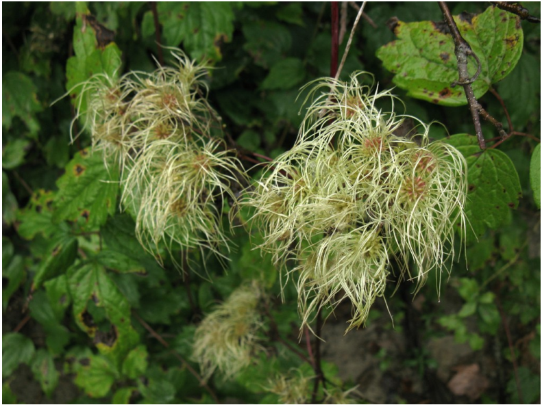
An interesting plant