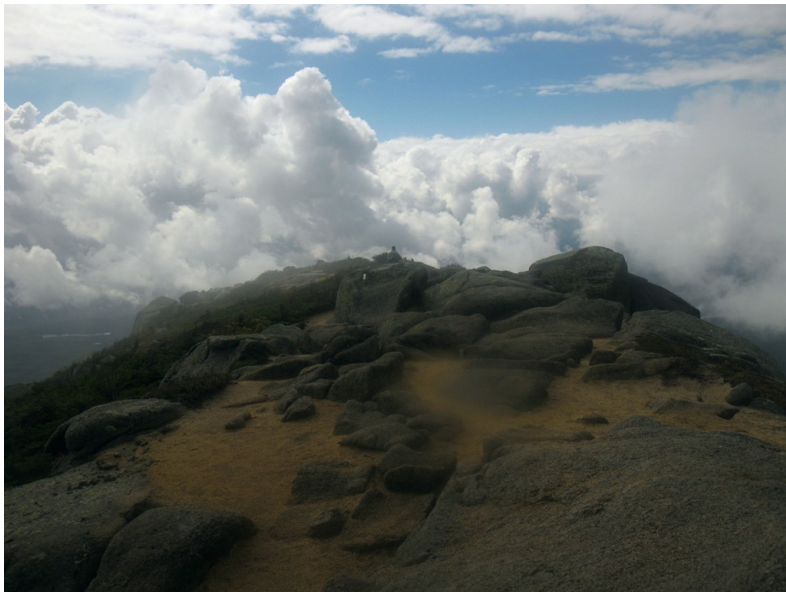
The trail along the ridge