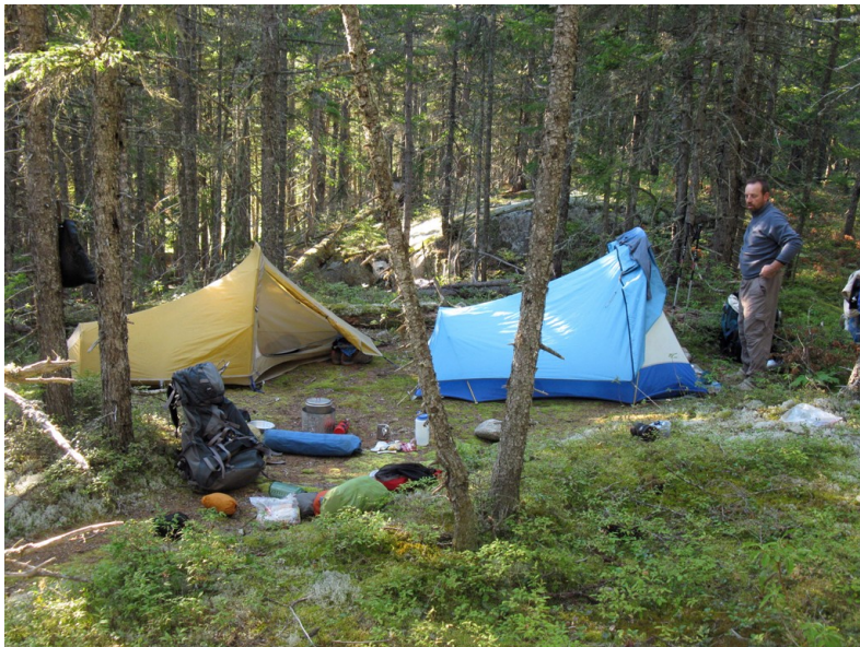
Tentsite at Crescent Pond