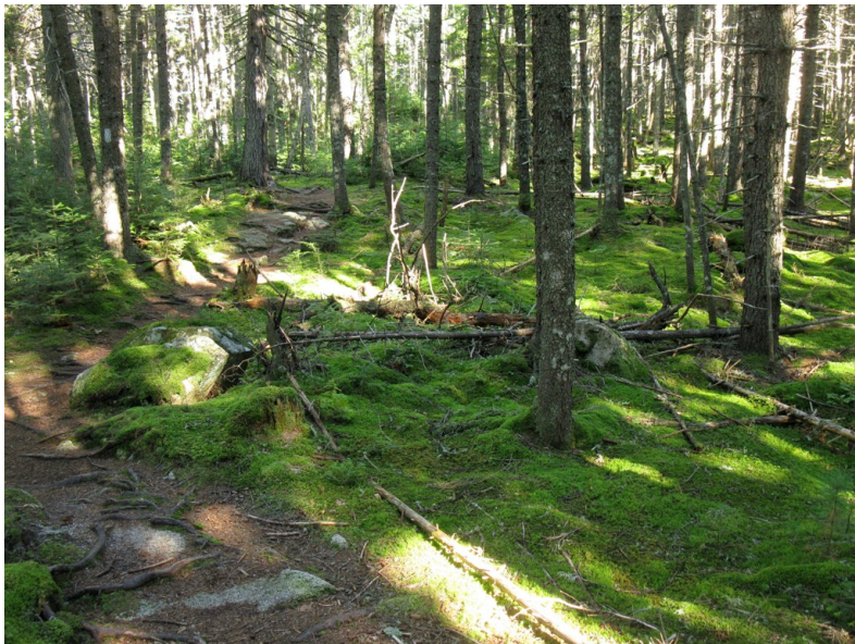
The trail near Crescent Pond