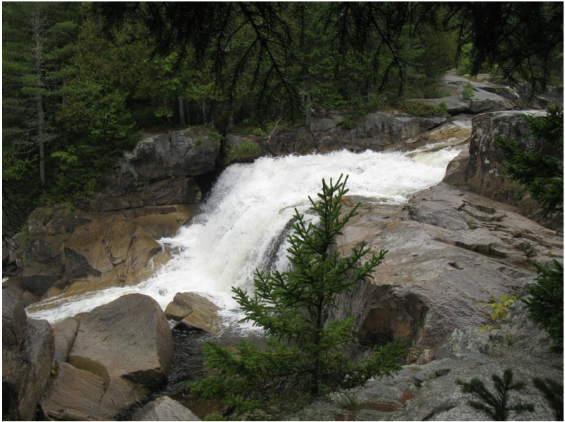
Big Niagara Falls on Nesowadnehunk Stream