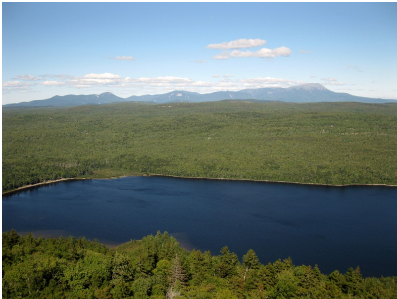
Nahmakanta Lake and Mt. Katahdin