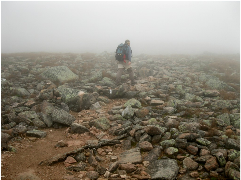
“Frenchy” on the Tableland