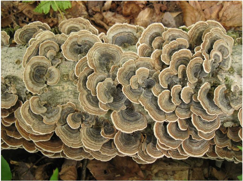
Fungus on a log