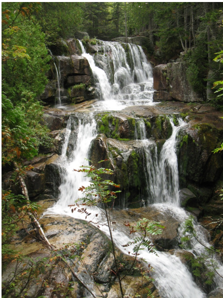
Katahdin Stream Falls