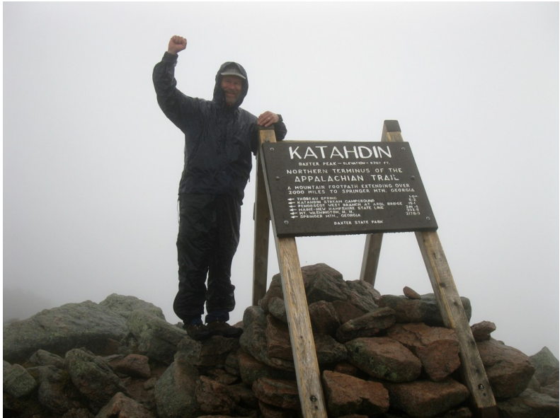
On the summit of Mt. Katahdin