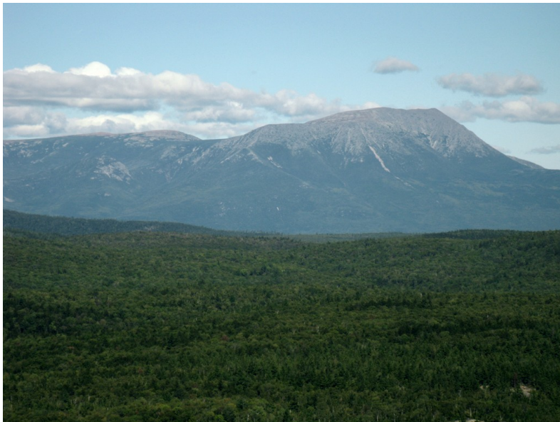
Mt. Katahdin from Nesuntabunt Mountain