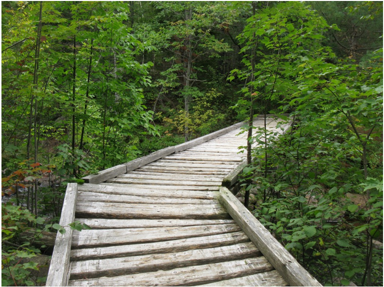
Footbridge over Katahdin Stream