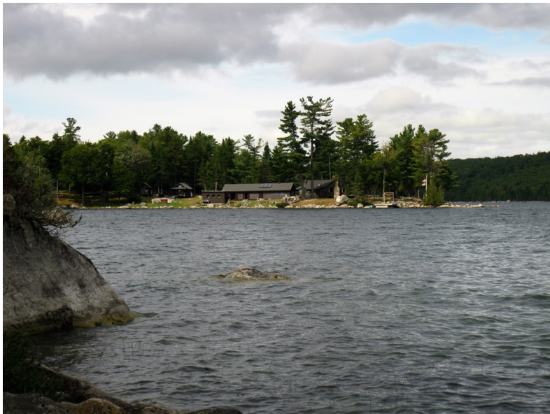
A lodge on Rainbow Lake