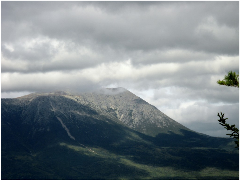
Mt. Katahdin from Rainbow Ledges