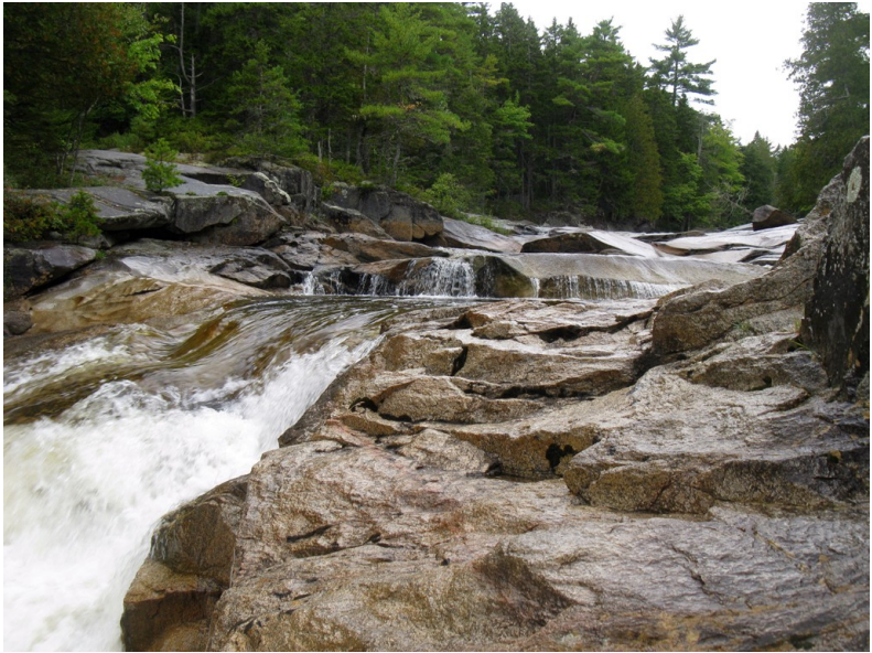
Big Niagara Falls