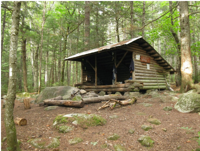
Hurd Brook Lean-to