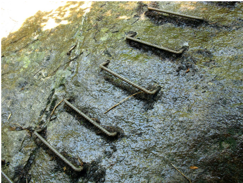
Iron rungs up Smarts Mountain