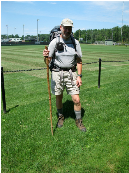
Beginning the hike from the soccer field