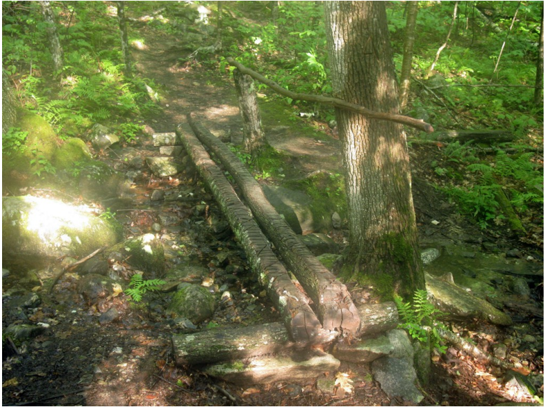
A log footbridge