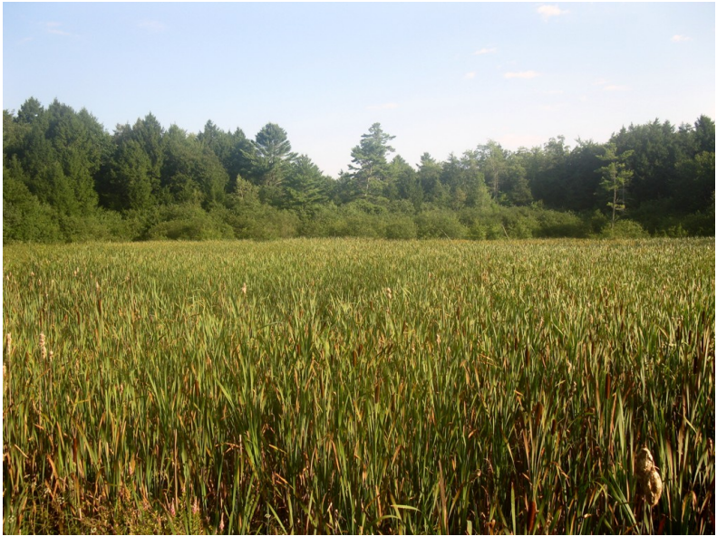
A cattail marsh