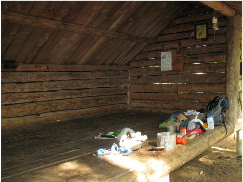
The interior of Jeffers Brook Shelter