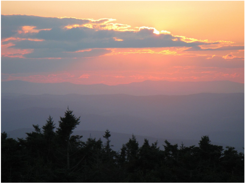
Sunset from Smarts Mountain