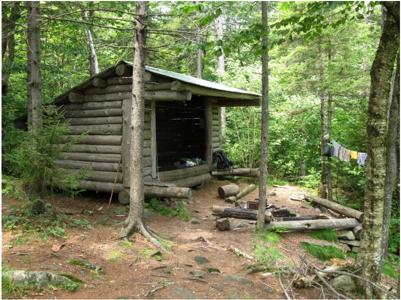
Moose Mountain Shelter