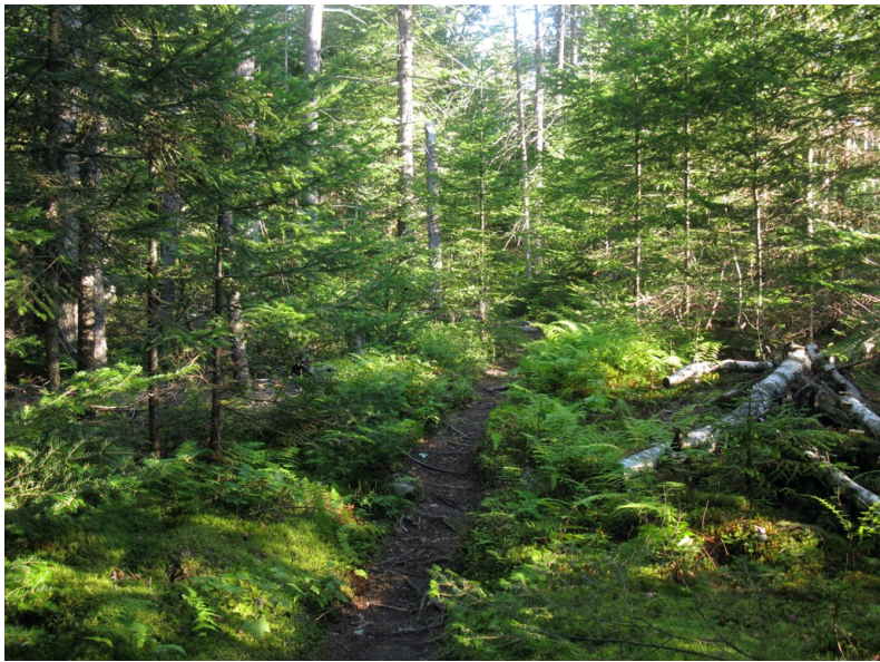
The trail on Ore Hill