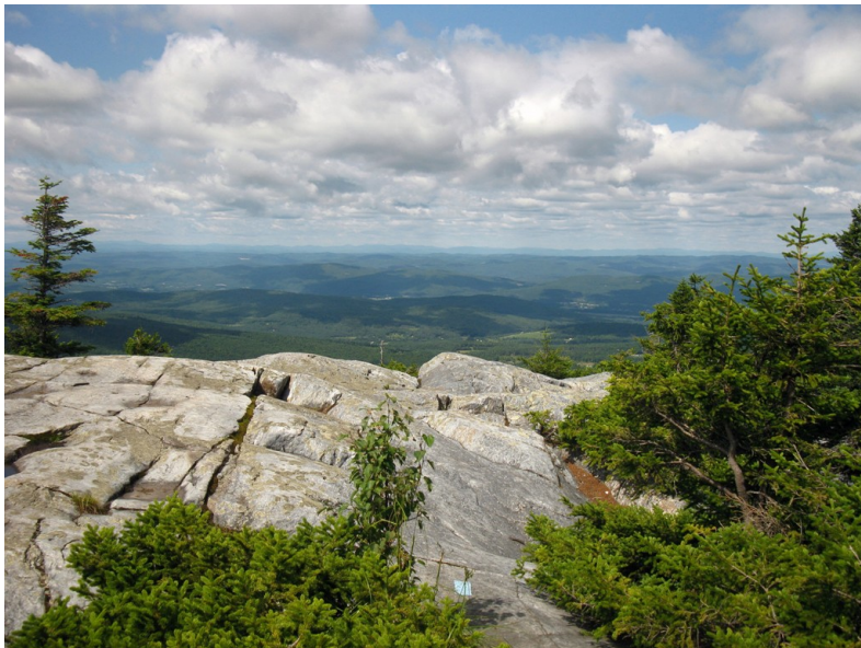
The view north from Mt. Cube