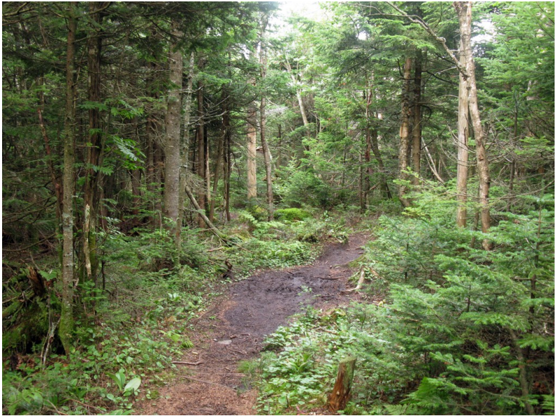
Mud in the trail