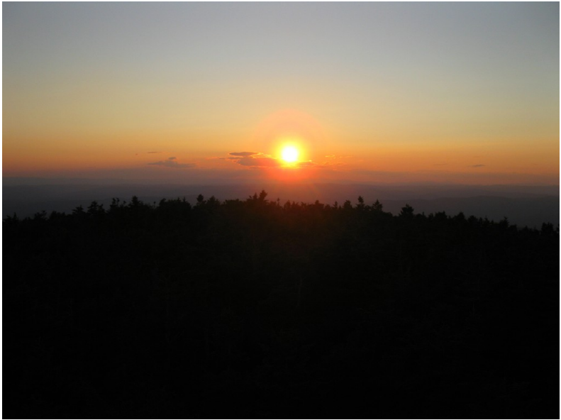
Sunset from Smarts Mountain