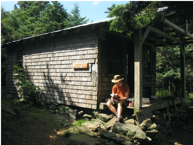
Thru-hiker "Tup" at the Firewarden's Cabin