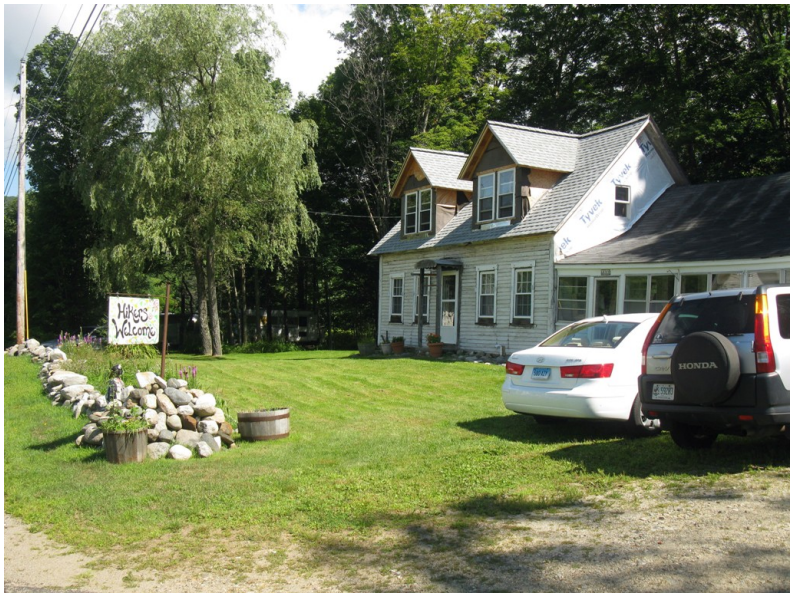
The Hikers Welcome hostel at Glenclyff