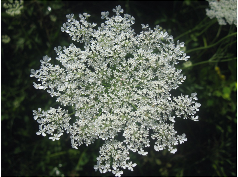
Queen Anne's Lace