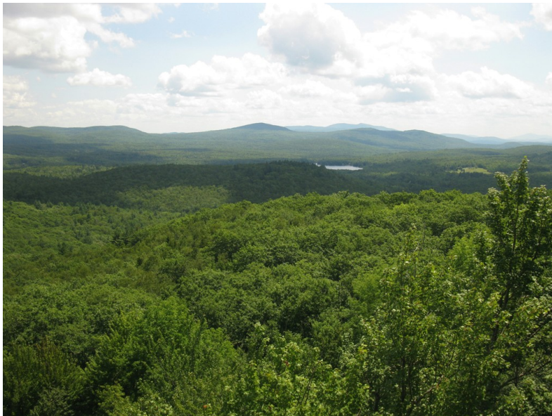
The view from Lambert Ridge