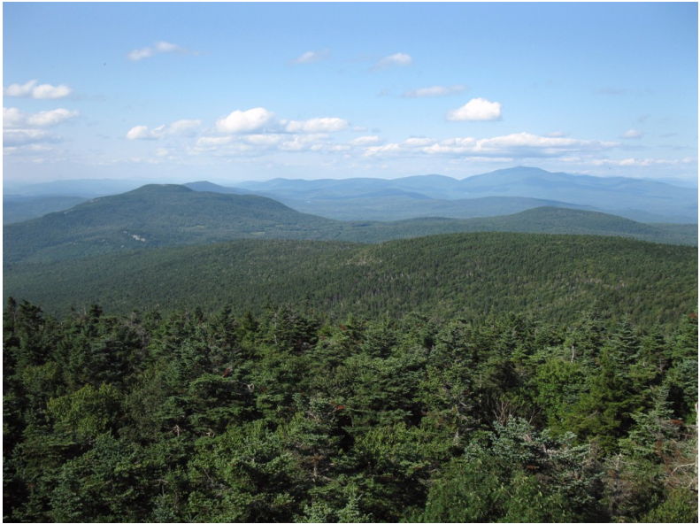
Mt. Cube from Smarts Mountain