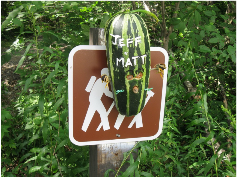
A gift for two hikers at Glenclyff