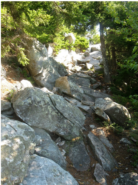
The steep trail up Mt. Cube