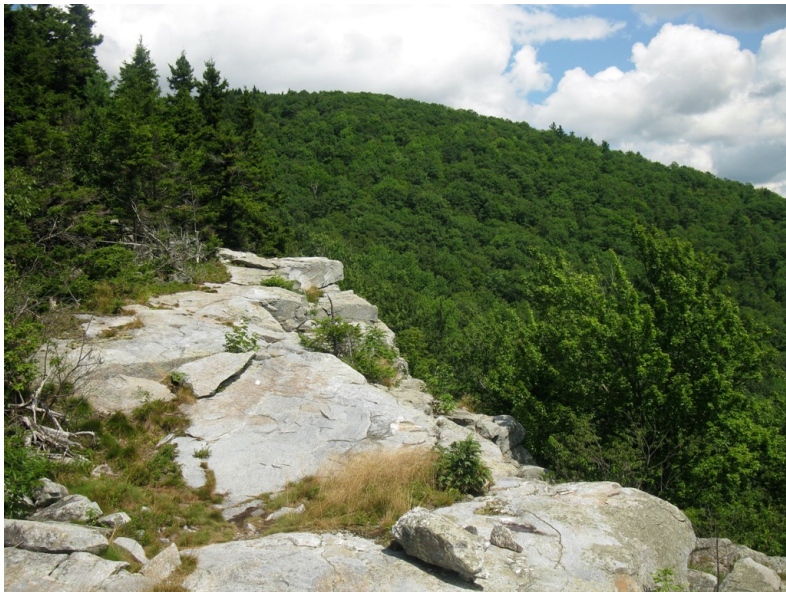
The view from Lambert Ridge