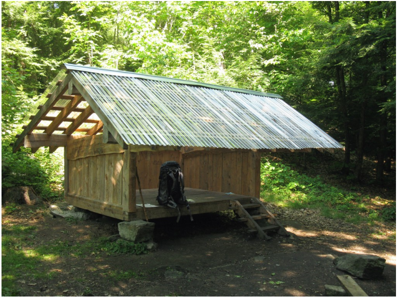
Velvet Rocks Shelter