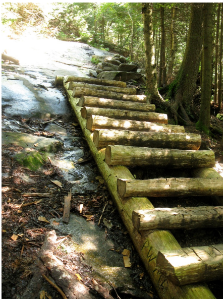
A ladder up Smarts Mountain