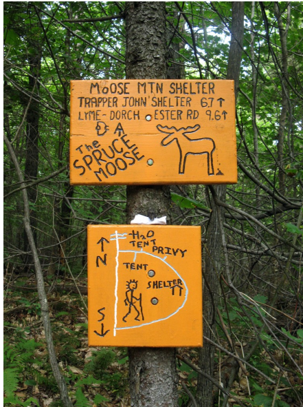
The sign to Moose Mountain Shelter