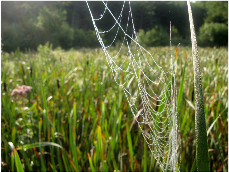
A dewy spiderweb