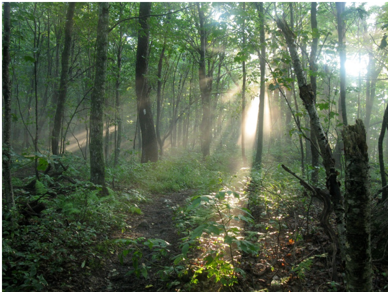
Morning mist on the trail