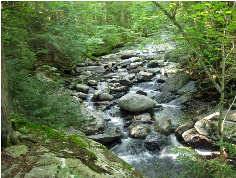
South Jacobs Brook