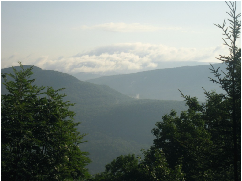
Mt. Moosilauke in the clouds