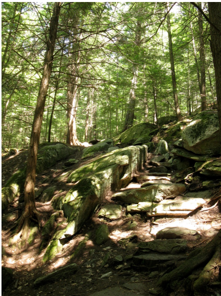
The trail up to Velvet Rocks Shelter