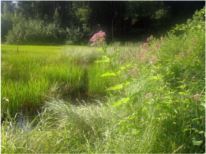
Flowers in beaver pond