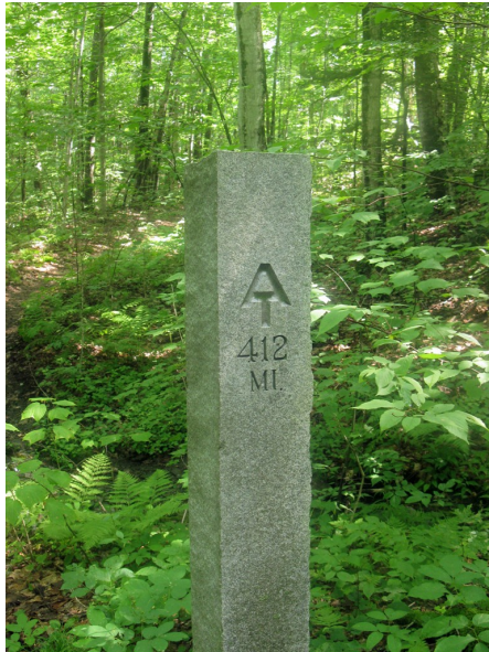
A marble trail marker