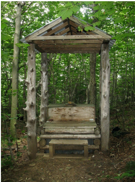
The privy at Moose Mountain Shelter