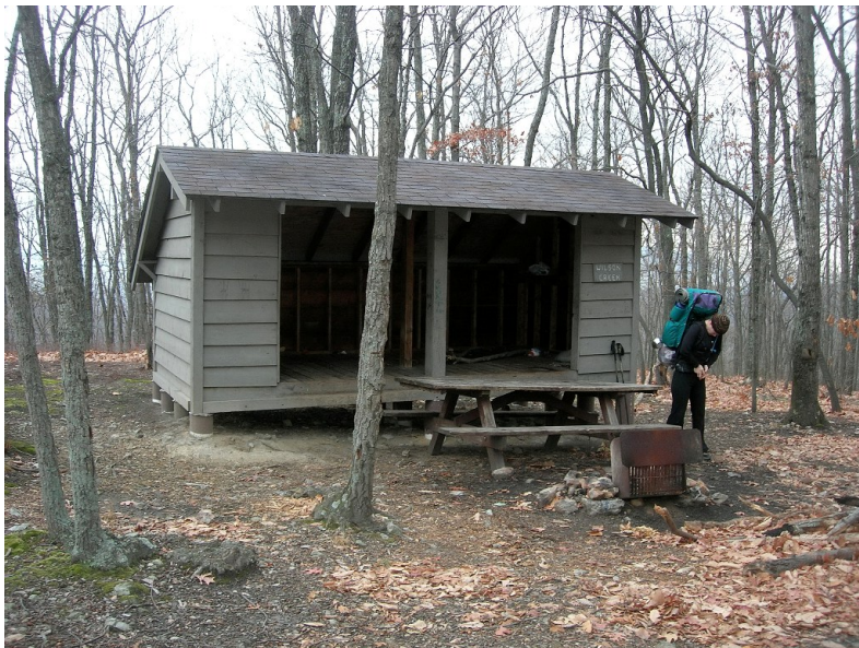
A rest break at Wilson Creek Shelter