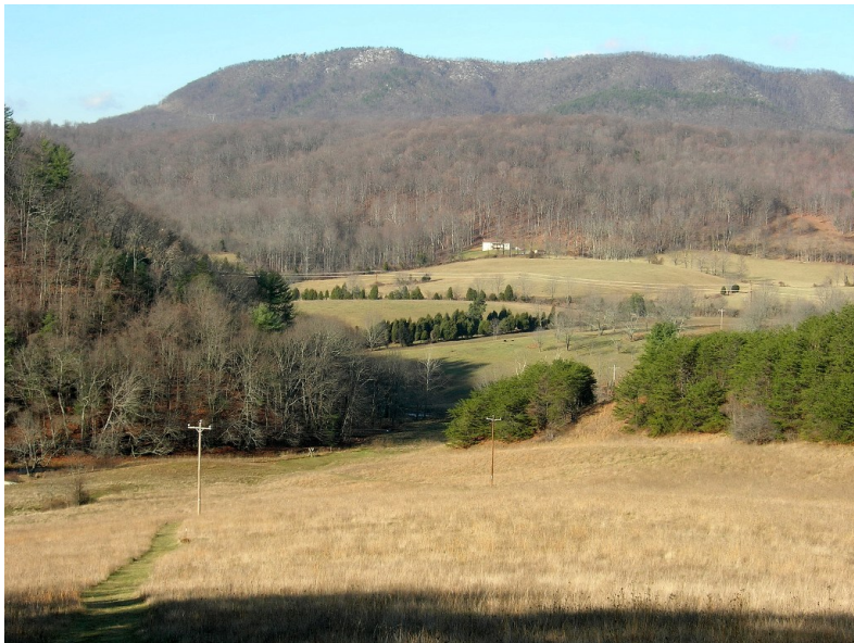
The Catawba Valley and Cove Mountain