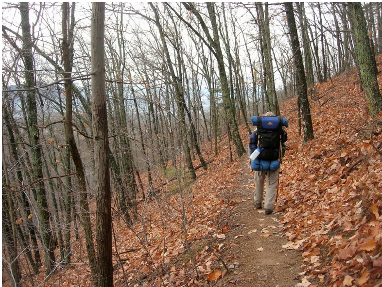
The AT on Fullhardt Knob