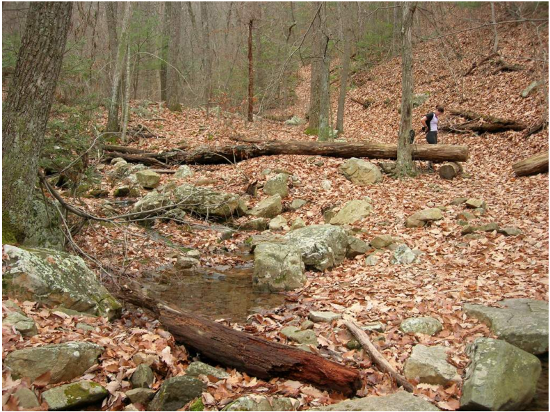
A rest break at Curry Creek