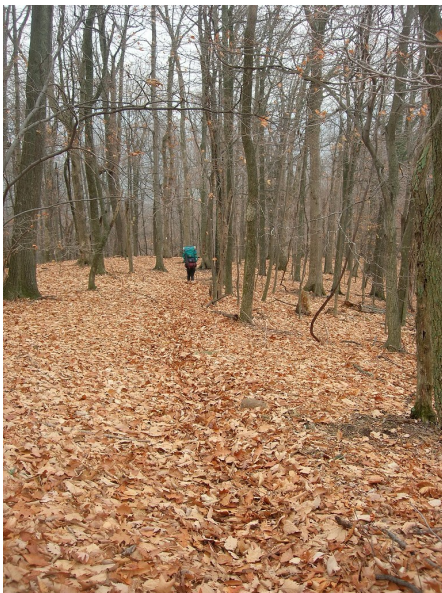
The AT on Tinker Mountain