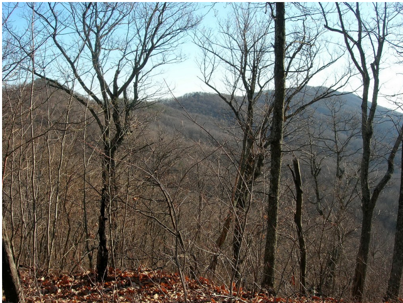
Craig Creek Valley