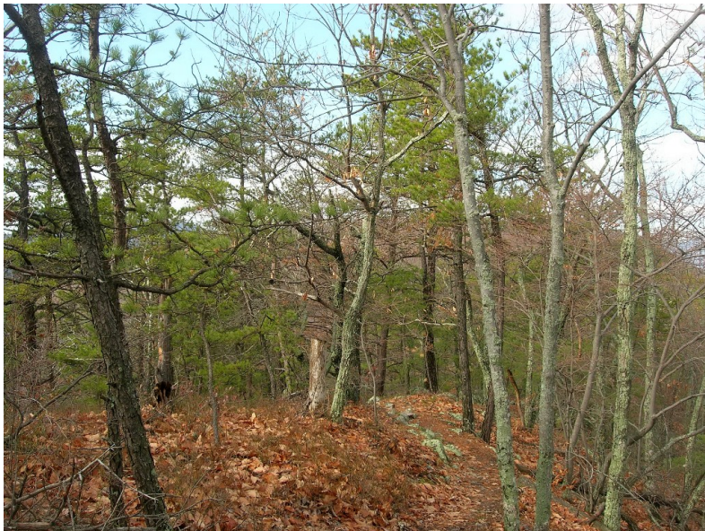
The AT near Angel Gap