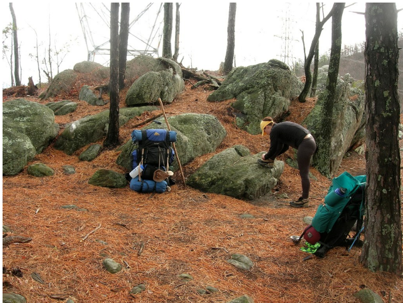
Lunch on Tinker Mountain