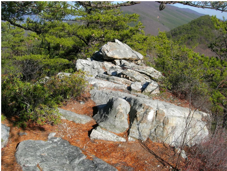
The AT on Cove Mountain