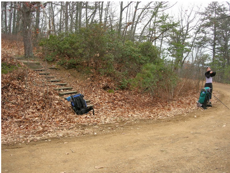
Crossing Shay Hollow Road