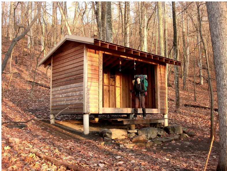
A sunny morning