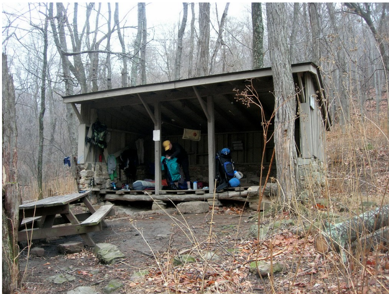
Lamberts Meadow Shelter