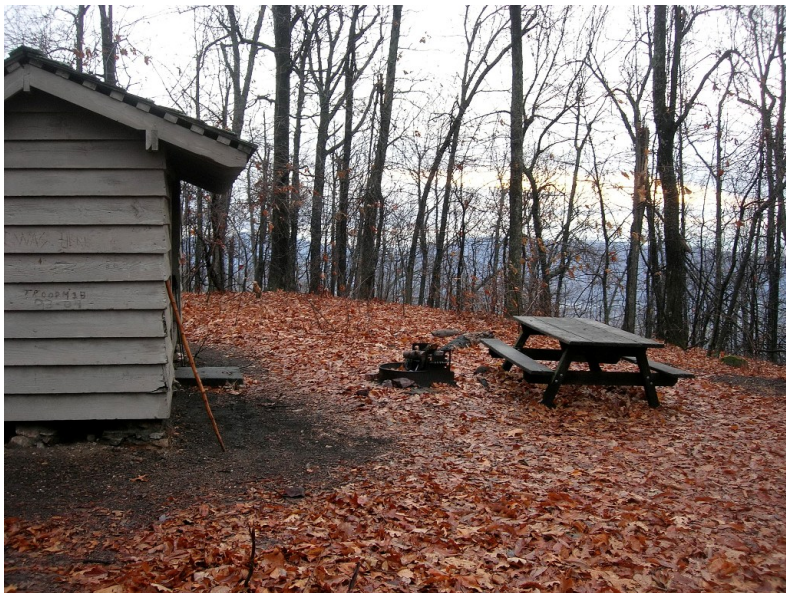
Morning at Fullhardt Knob Shelter