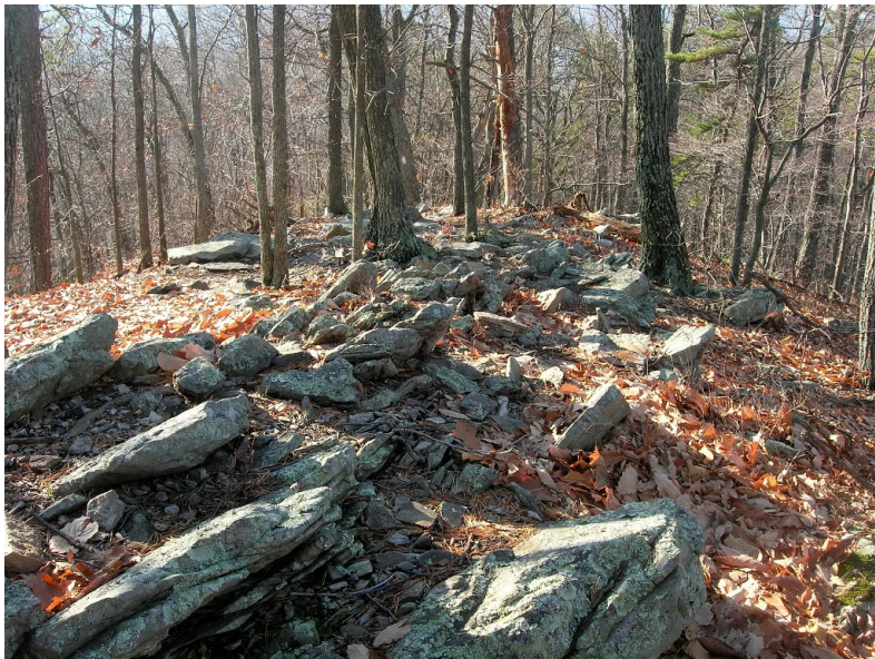
The AT on Catawba Mountain