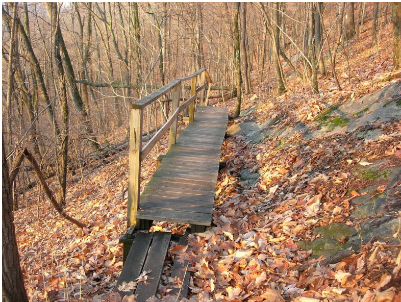
A little help on the sidehill