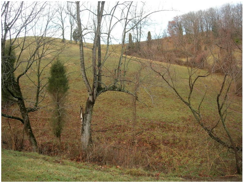
The Roanoke Valley