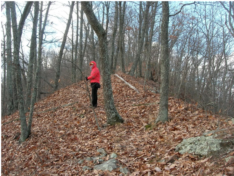
Climbing Brush Mountain