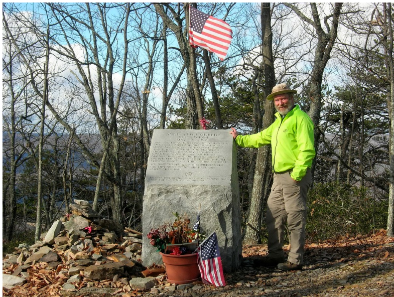
The Audie Murphy Memorial