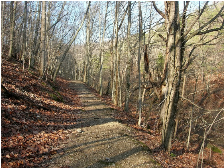
The AT around Sandstone Ridge