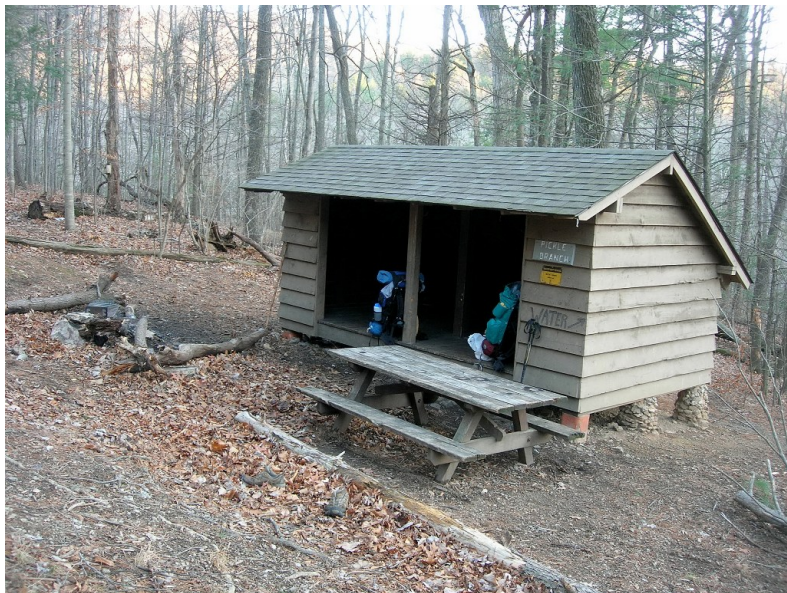
Pickle Branch Shelter