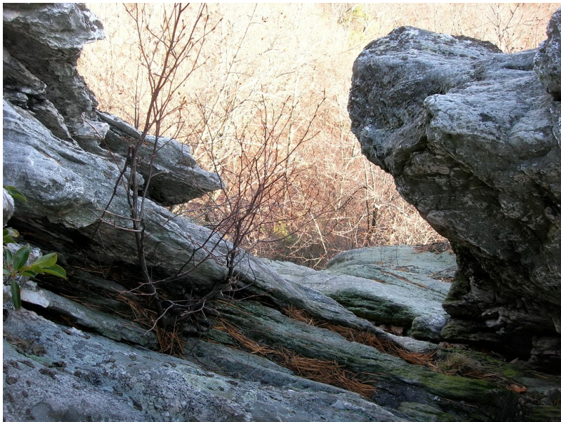
The rocks at Dragon's Tooth