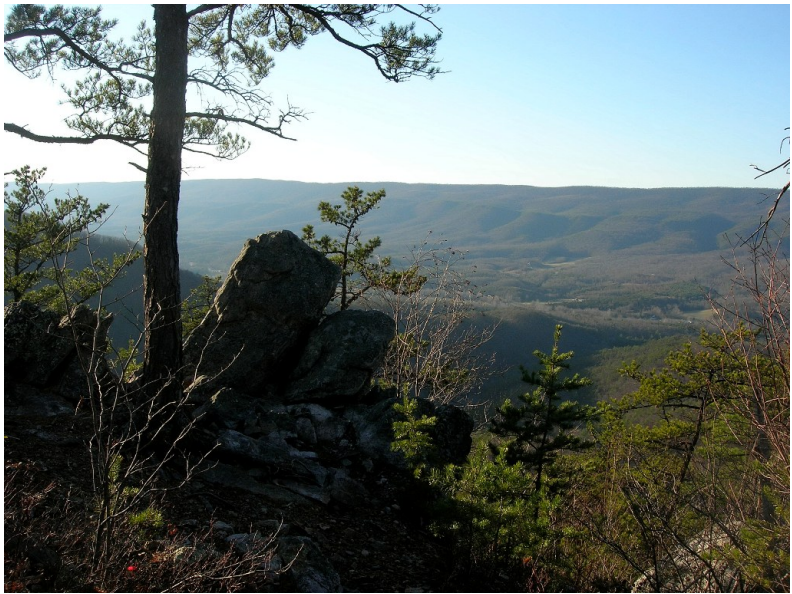
Craig Creek Valley