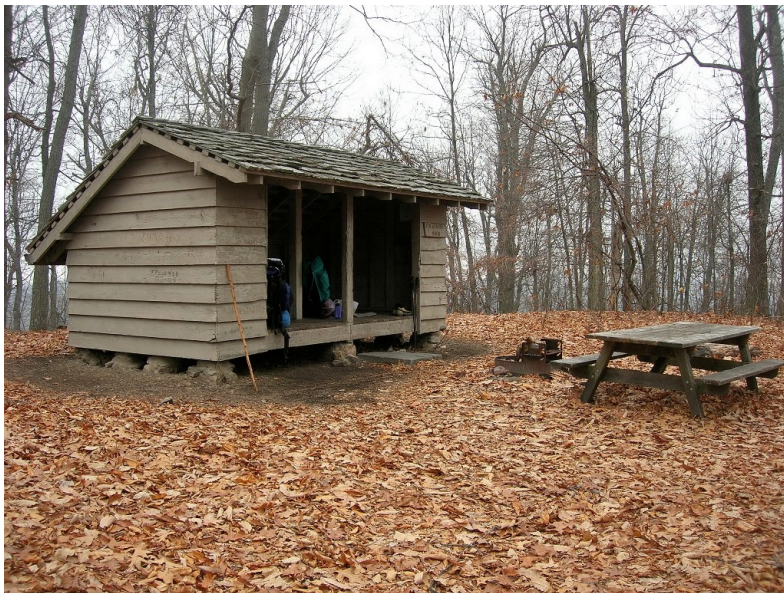
Fullhardt Knob Shelter