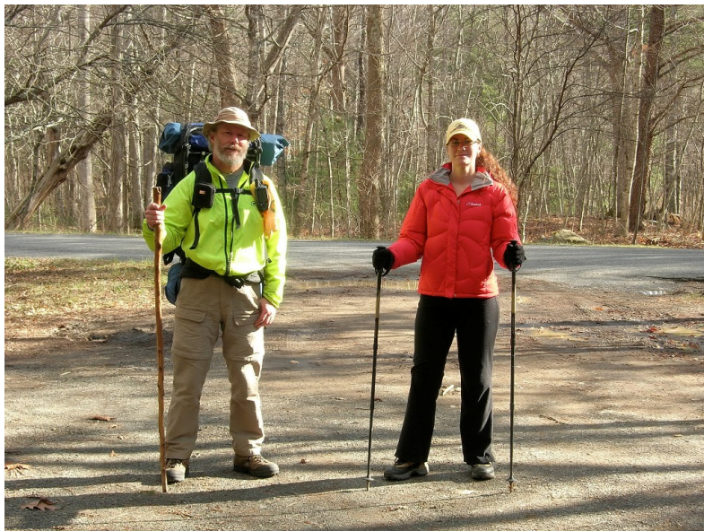
The end of the hike at Craig Creek