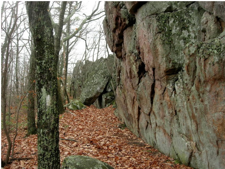
A rock wall near Hay Rock