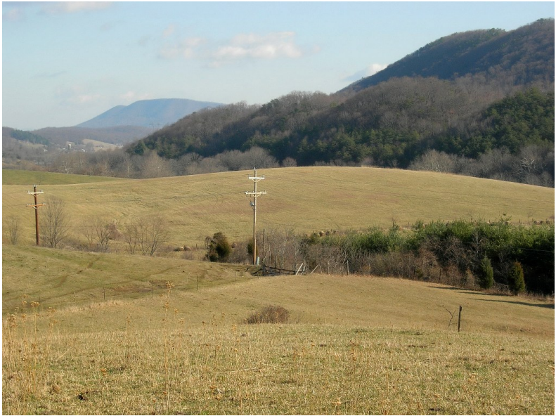
The Catawba Valley