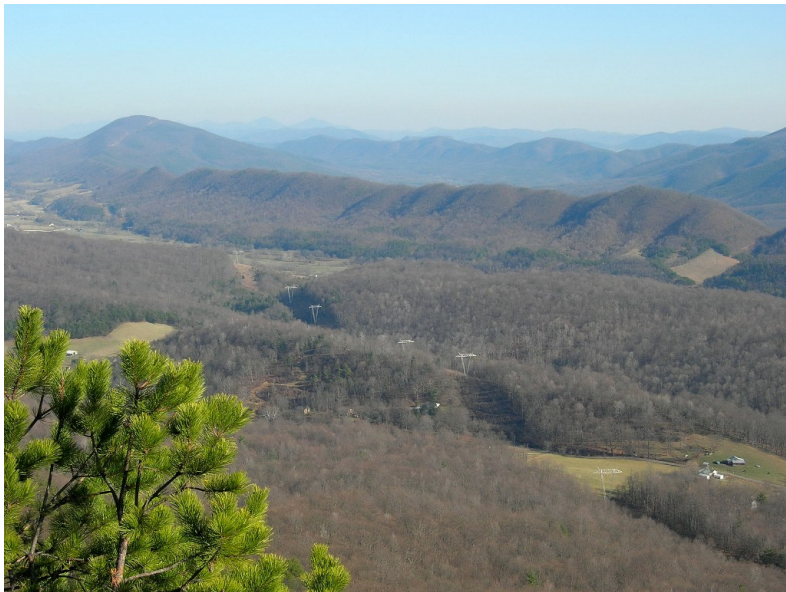
Catawba Mountain and McAfee's Knob