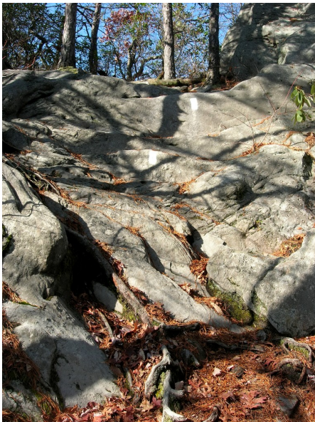
The AT on Cove Mountain