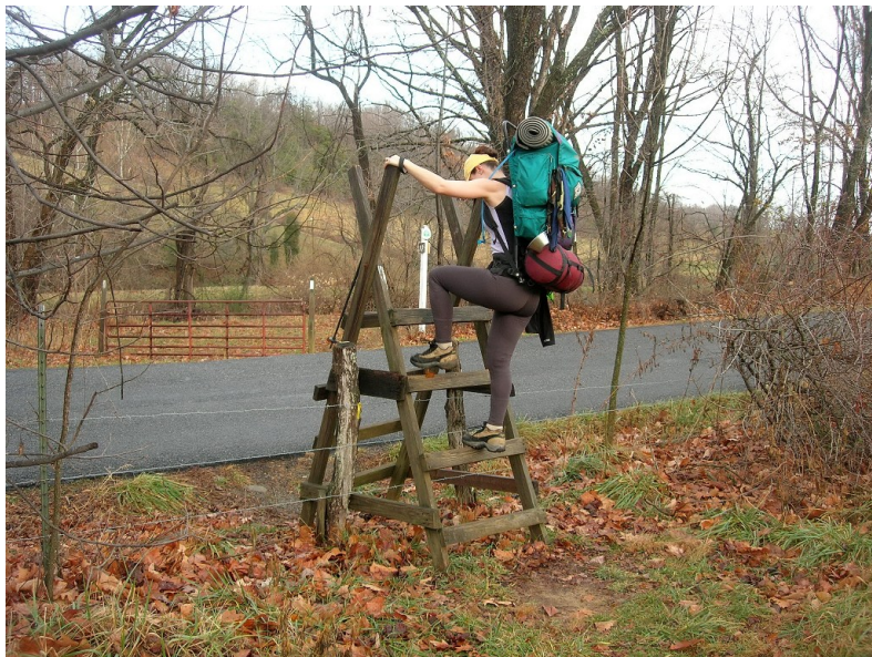
Crossing a stile