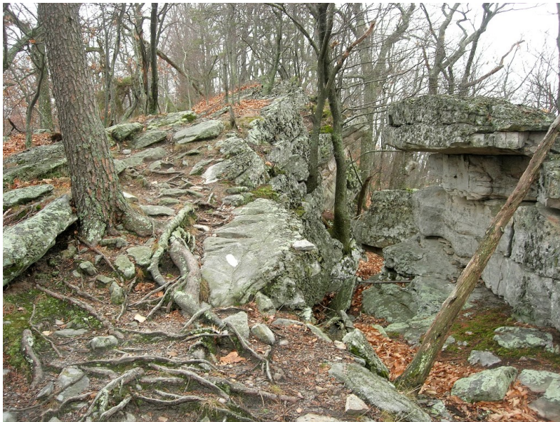
The AT on Tinker Mountain