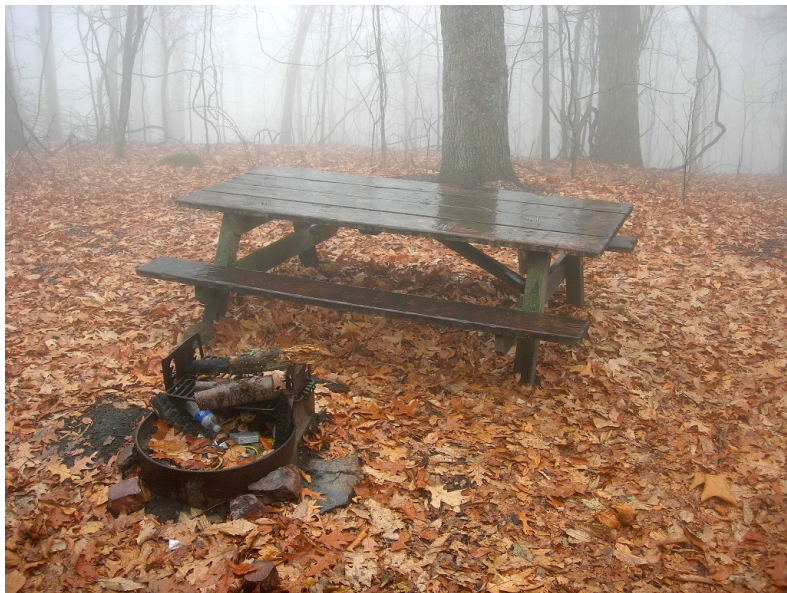
A rainy afternoon