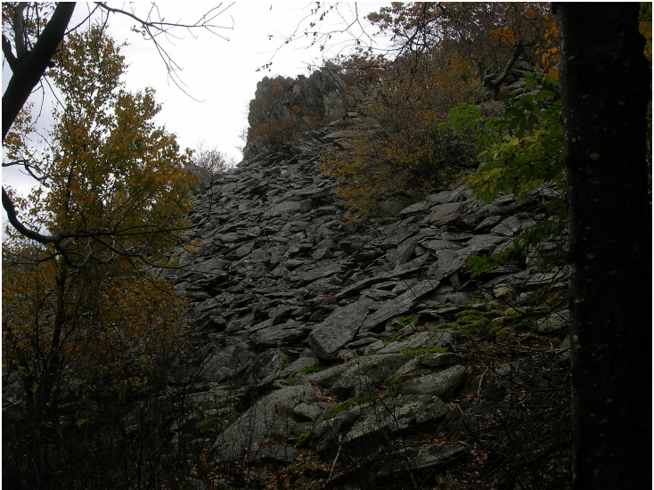
Rockslide on Humpback Mountain