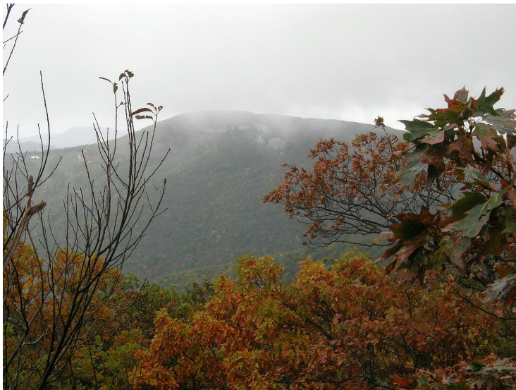
Wintergreen from Humpback Mountain