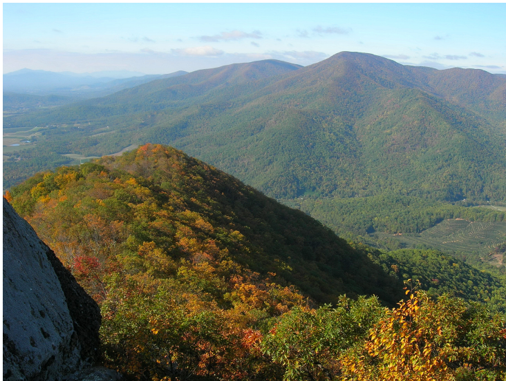
The Priest from Chimney Rocks