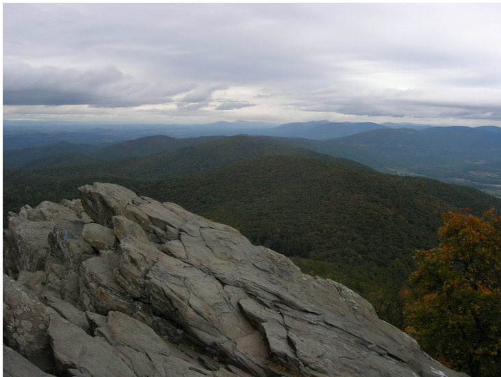
North from Humpback Rocks