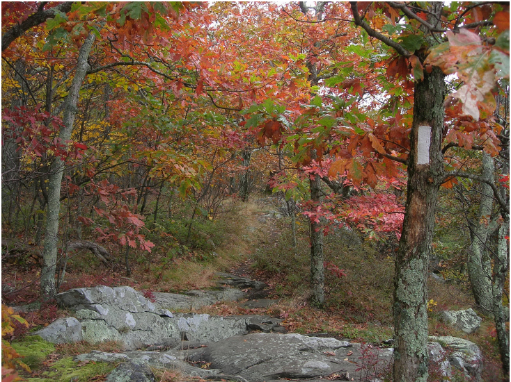
The trail on Humpback Mountain