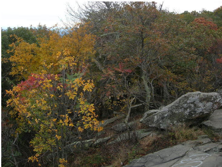
Fall colors on Humpback Mountain