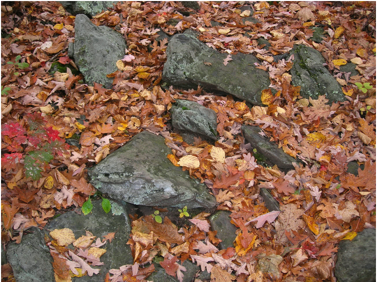
Leaves in the trail