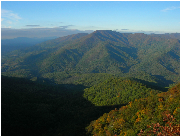
The Priest from Hanging Rock