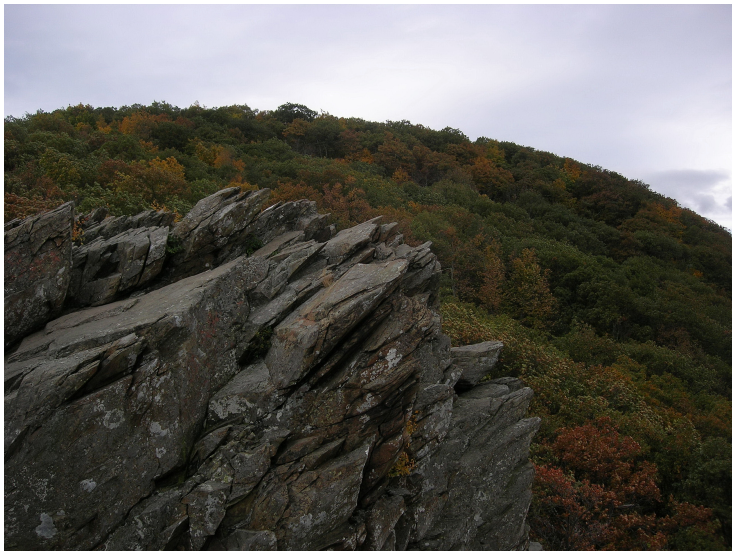
South from Humpback Rocks