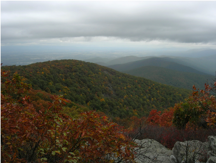
North from summit of Humpback Mountain