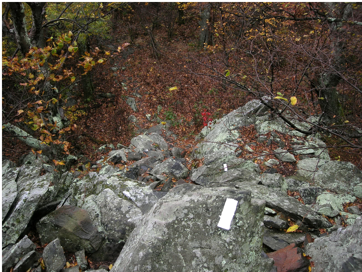
A steep descent near Laurel Springs Gap