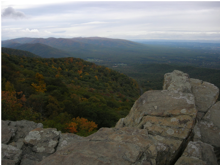
Southwest from Humpback Rocks