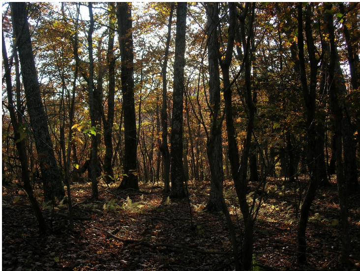
Fall colors on Porters Ridge