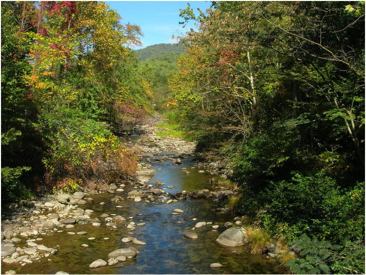
The Tye River