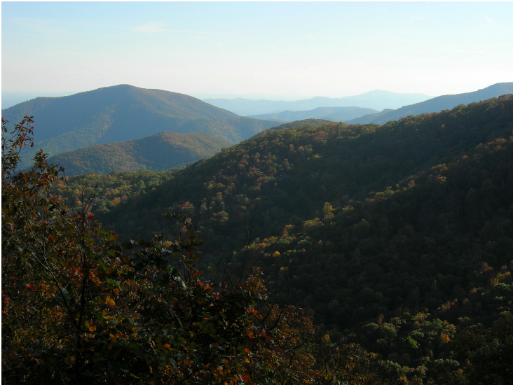
South from Cash Hollow Rock