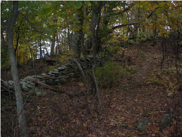
Stone wall by the trail on Humpback Mountain