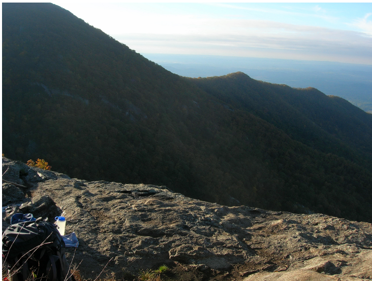
Chimney Rocks from Hanging Rock