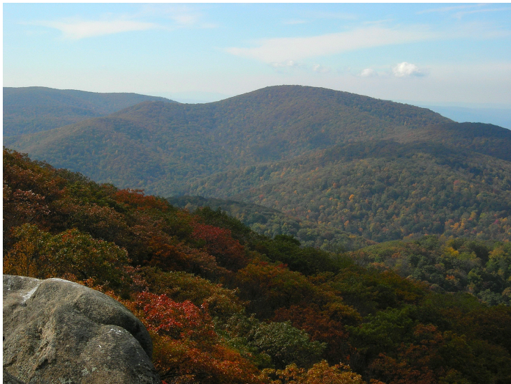
Maintop and Spy Rock from The Priest