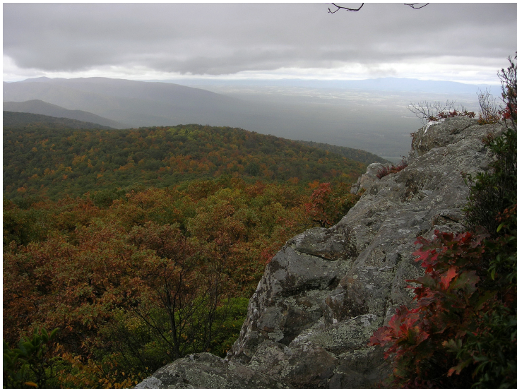
Southwest from Humpback Mountain