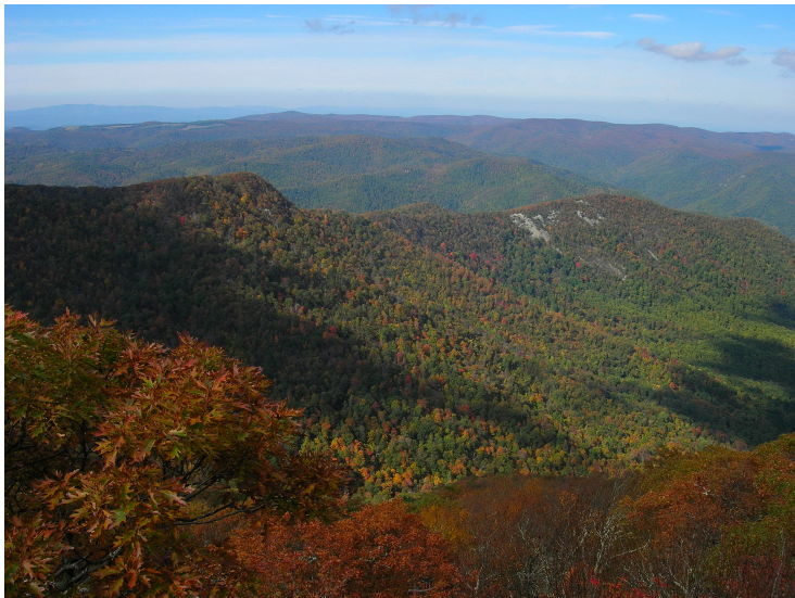
Pinnacle Ridge from The Priest