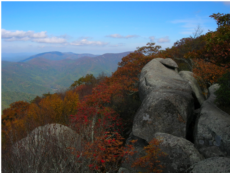
Three Ridges Mountain from The Priest