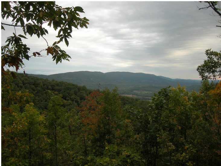
North from the trail on Dobie Mountain