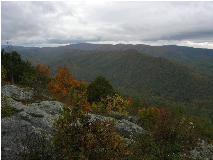
Southwest from side of Devils Knob